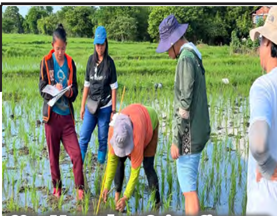
30 na Magsasaka sa Sariaya, Sinanay sa Integrated Nutrient & Pest Management sa Pagpapalay- story p.4A