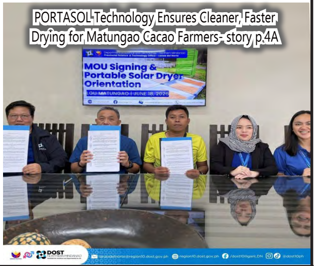
PORTASOL Technology Ensures Cleaner, Faster Drying for Matungao Cacao Farmers- story p.4A

ACCEPTING ADS, PLEASE CALL : 0977-7844136/ 0968-7122927