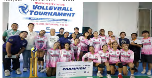
QC WIDE VOLLEYBALL TOURNAMENT CHAMPION - BARANGAY PAYATAS

Salamat sa lahat ng mga atleta, coach, opisyal, boluntaryo, at tagasuporta para sa inyong dedikasyon, sportsmanship, at simbuyo ng damdamin para sa laro. Sama-sama, ipinagdiriwang natin hindi lamang ang tagumpay kundi pati na rin ang pagkakaisa, pagkakaibigan, at diwa ng pamayanan. To God Be The Glory QC Volleyball 2026." mensahe mula sa Quezon City Development Office.