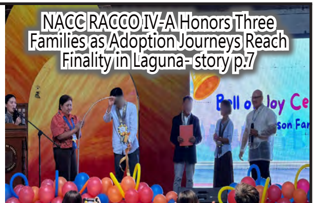
NACC RACCO IV-A Honors Three Families as Adoption Journeys Reach Finality in Laguna- story p.7