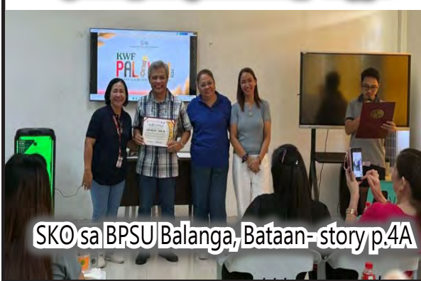
SKO sa BPSU Balanga, Bataan- story p.4A