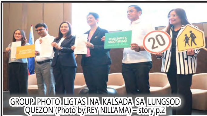
GROUP PHOTO LIGTAS NA KALSADA SA LUNGSOD QUEZON - story p.2