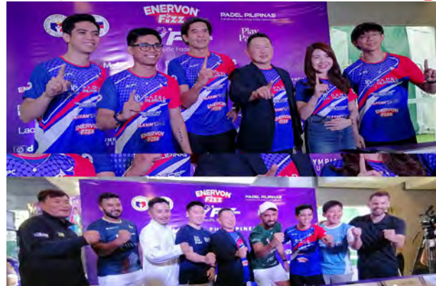
ASIA PACIFIC PADEL CUP MANILA PHILIPPINE 2026

Binigyang-diin niya na mas madaling matutunan ang padel kumpara sa tennis at malaking tulong ang pagkakasama nito