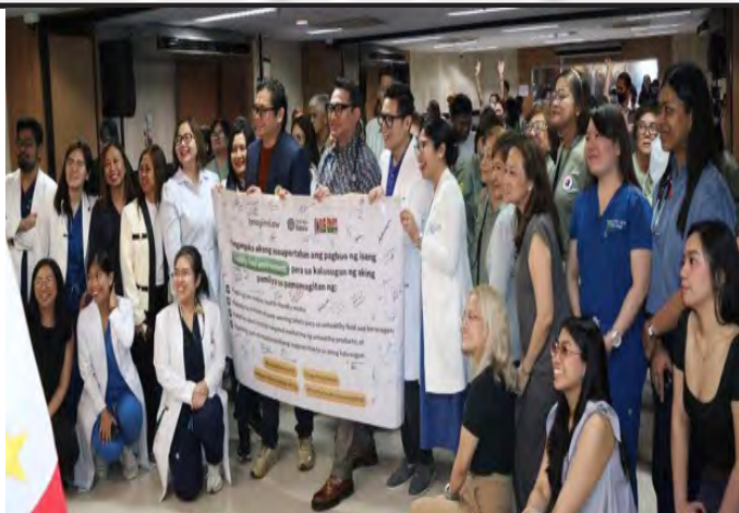
NAGSAMA-SAMA sa group photo mga opisyal ng tatlong organisasyon tulad ng Philippine Society of Nephrology (PSN), St. Luke’s, at ImagineLaw kabilang ang mga pasyente sa kanilang partisipasyon sa naturang kaganapan na ginanap sa St. Luke’s Medical Center St. Luke’s. - story p.2