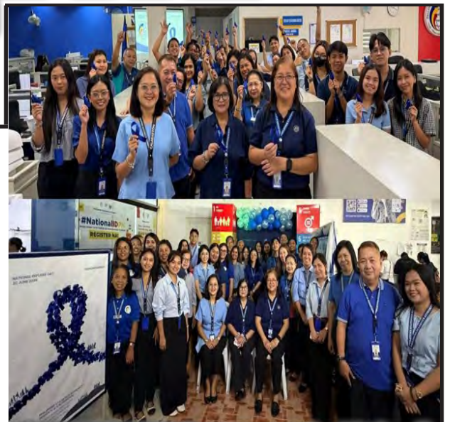
PSA RSSO IV-A Commemorates National Refugee Day 2026 Through Blue Monday Activity- story p.4