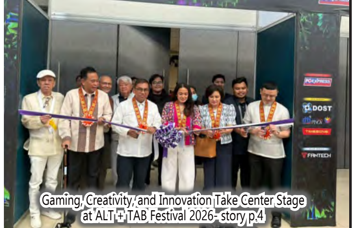
Gaming, Creativity, and Innovation Take Center Stage at ALT+TAB Festival 2026- story p.4

ACCEPTING ADS, PLEASE CALL : 0977-7844136/ 0968-7122927