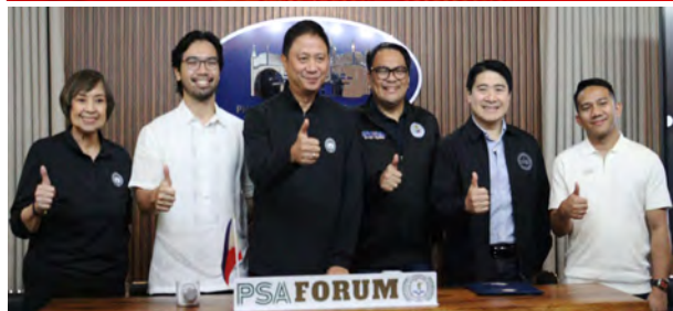
THUMBS UP PARA BATANG PINOY 2026 THE SMILE CITY