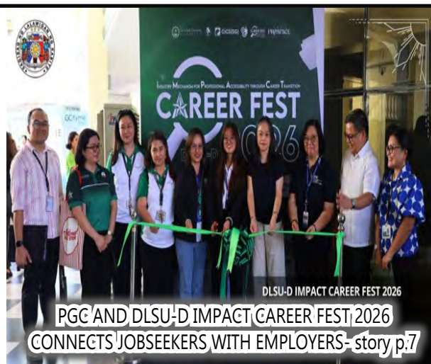
DLSU-D IMPACT CAREER FEST 2026 PGC AND DLSU-D IMPACT CAREER FEST 2026 CONNECTS JOBSEEKERS WITH EMPLOYERS- story p.7