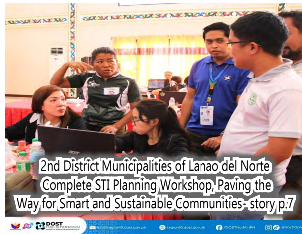
2nd District Municipalities of Lanao del Norte Complete STI Planning Workshop, Paving the Way for Smart and Sustainable Communities- story p.7