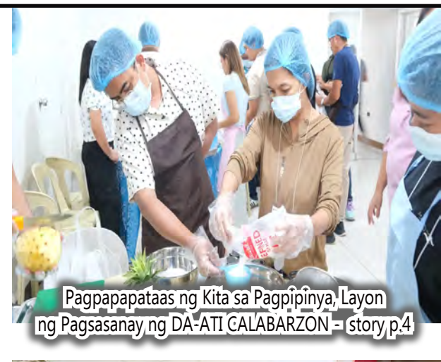
Pagpapapataas ng Kita sa Pagpipinya, Layon ng Pagsasanay ng DA-ATI CALABARZON - story p.4