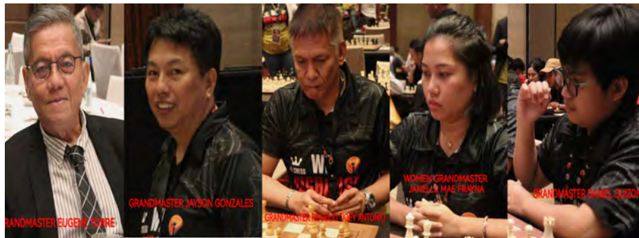
5 GRANDMASTER SA GOV. OAMINAL CHESS FESTIVAL