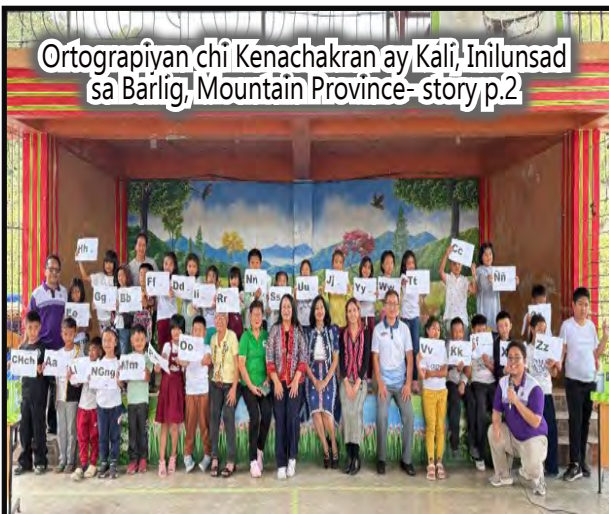
Ortograpiyan chi Kenachakran ay Kali, Inilunsad sa Baring, Mountain Province- story p.2