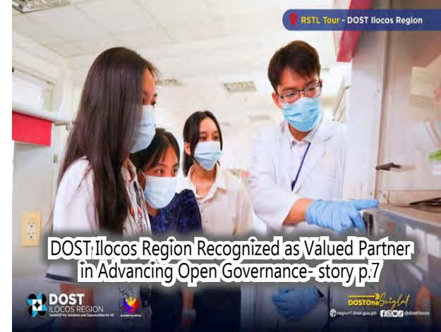
DOST Ilocos Region Recognized as Valued Partner in Advancing Open Governance- story p.7

ACCEPTING ADS, PLEASE CALL : 0977-7844136/ 0968-7122927