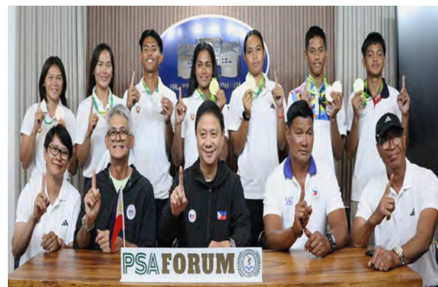
SIGN AS ONE PHILIPPINE ROWING TEAM MEDALIST IN PSA FORUM