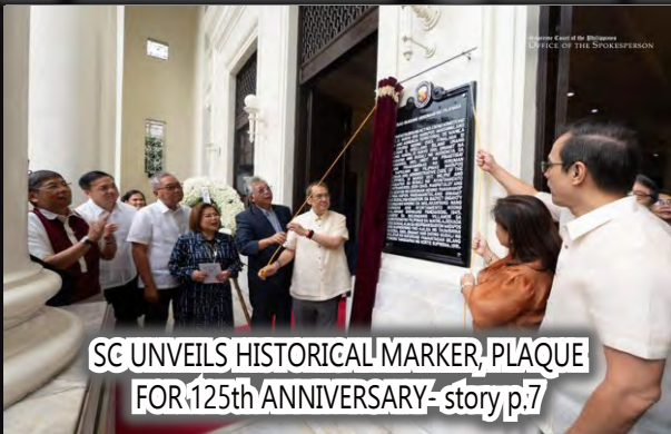
SC UNVEILS HISTORICAL MARKER, PLAQUE FOR 125th ANNIVERSARY- story p.7