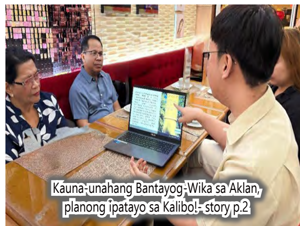
Kauna-unahang Bantayog-Wika sa Aklan, planong ipatayo sa Kalibo!- story p.2