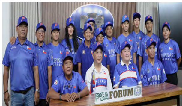
PHILIPPINE AMATEUR BASEBALL ASSOCIATION

Habang pinaigting na mas palakasin ang programa sa grassroots development, naghahanda ang Philippine Amateur Baseball Association para sa isang serye ng mga internasyonal na kompetisyon, exposure, at hosting para sa mga miyembro ng national team.