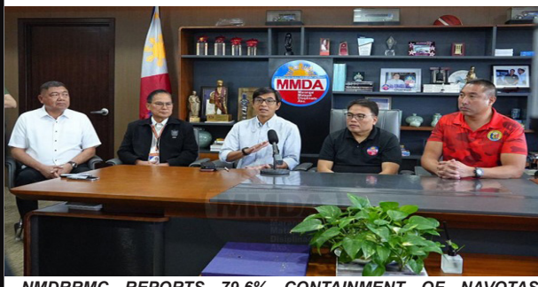
MMDRMC REPORTS 79.6% CONTAINMENT OF NAVOTAS SANITARY LANDFILL FIRE- story p.7