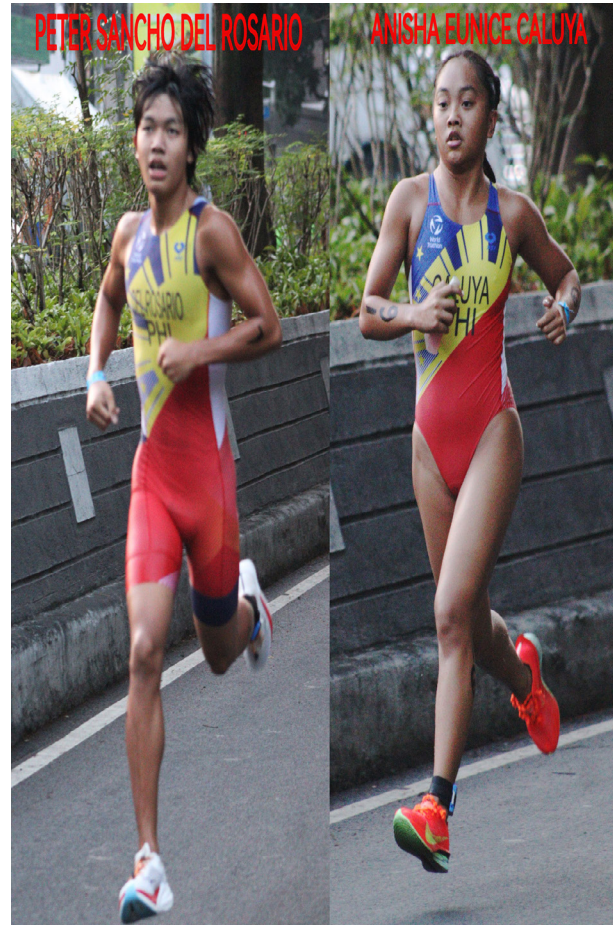
NATIONAL AGE GROUP AQUATHLON JR ELITE MEN AND WOMEN'S CHAMPION