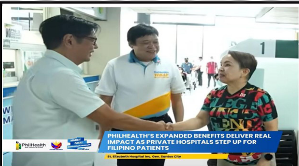
PHILHEALTH'S EXPANDED BENEFITS DELIVER REAL IMPACT AS PRIVATE HOSPITALS STEP UP FOR FILIPINO PATIENTS

PHILHEALTH'S EXPANDED BENEFITS DELIVER REAL IMPACT AS PRIVATE HOSPITALS STEP UP FOR FILIPINO PATIENTS- story p.4