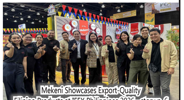
Mekeni Showcases Export-Quality Filipino Products at IFEX Philippines 2026 - story p.6

ACCEPTING ADS, PLEASE CALL: 0977-7844136/ 0968-7122927