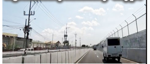
Fully Connected CAVITEX (C5) Link Enhances Logistics Efficiency and Reliability - story p.6