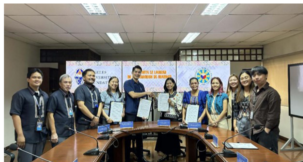
KWF at AUF, Lumagda ng Memorandum ng Unawaan- story p.2