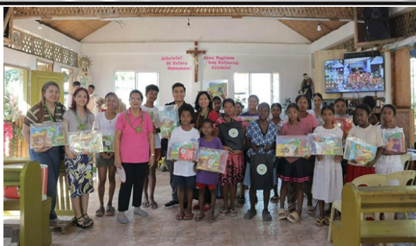
WIKANG INATI, TINUTUKAN NG KWF- story p.5

PHILHEALTH'S EXPANDED BENEFITS DELIVER REAL IMPACT AS PRIVATE HOSPITALS STEP UP FOR FILIPINO PATIENTS- story p.4