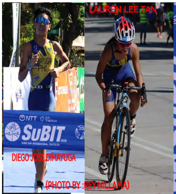
CHAMPION MEN AND WOMEN U15 SUBIC BAY INTERNATIONAL TRIATHLON