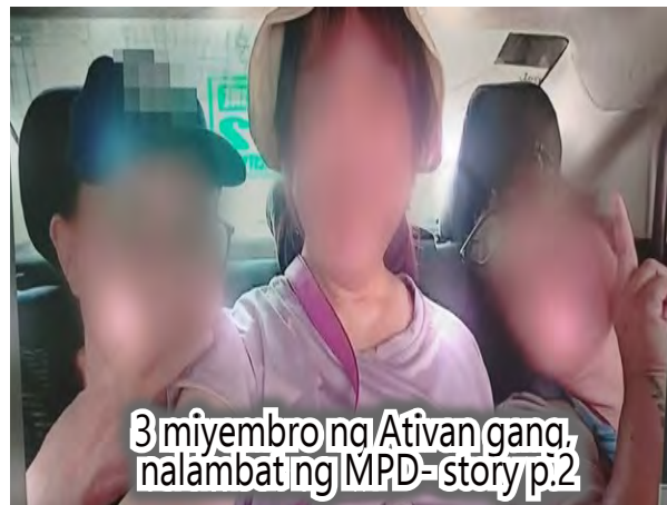
3 miyembro ng Ativan gang, nalambat ng MPD- story p.2