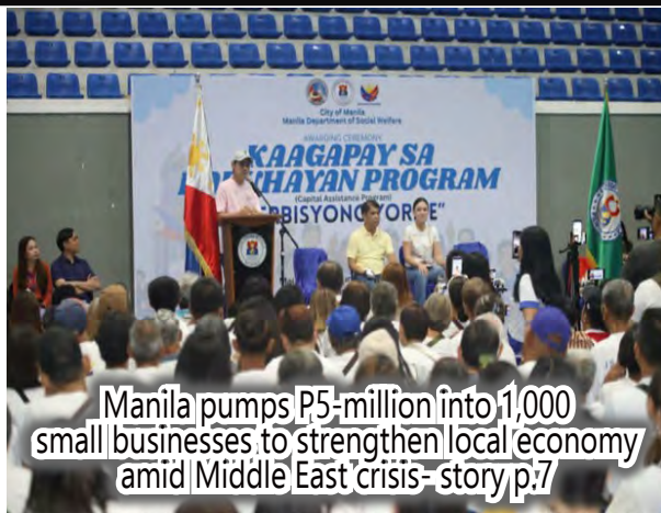
Manila pumps P5-million into 1,000 small businesses to strengthen local economy amid Middle East crisis- story p.7