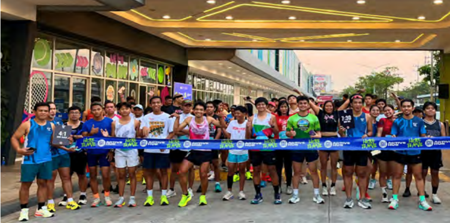
SM City Tanza recently held its SUPER FAM RUN, bringing together families, friends, and fitness enthusiasts for a day of wellness and community spirit.