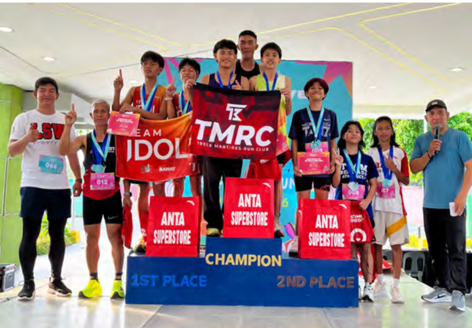
The event featured an energetic morning of running activities, culminating in joyful finish line moments that highlighted camaraderie and shared achievement. Participants of all ages filled the venue with enthusiasm, turning the run into a celebration of health, unity, and fun.