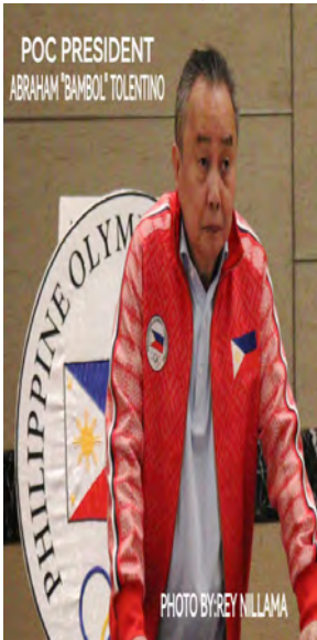
POC PRESIDENT ABRAHAM BAMBOL TOLENTINO

Ipinagmamalaki ni Tolentino ang ipinakita ng Team Philippines sa katatapos lamang na ika-33