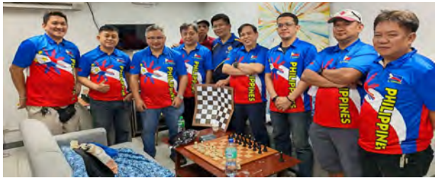
IIEE SIKAT CHESS TOURNAMENT WINNER