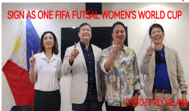
FIFA Futsal Women's World Cup Nobyembre 21 hanggang Disyembre 7