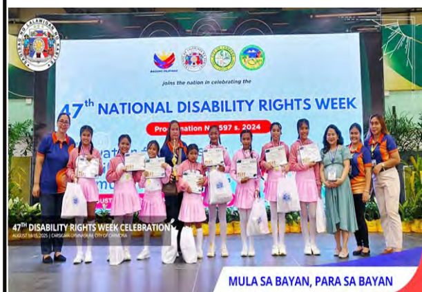
MULA SA BAYAN, PARA SA BAYAN

CAVITE MARKS 47TH DISABILITY RIGHTS WEEK WITH CALL FOR INNOVATION AND INCLUSION - story p.4