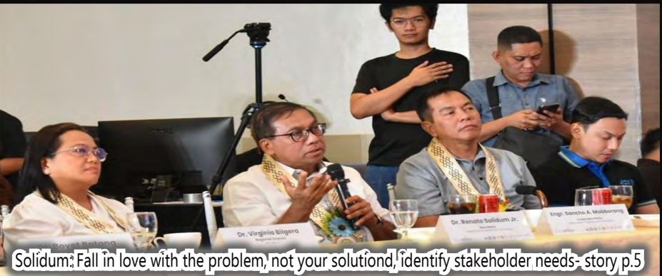
Solidum: Fall in love with the problem, not your solution, identify stakeholder needs- story p.5