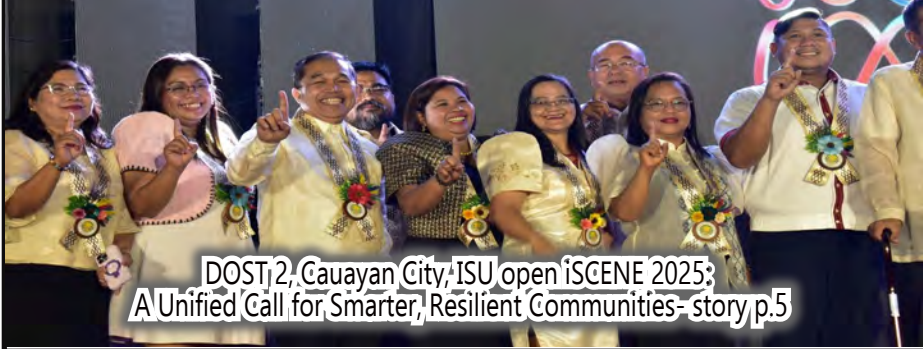
DOST 2, Cauayan City, ISU open iSCENE 2025: A Unified Call for Smarter, Resilient Communities- story p.5