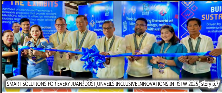
SMART SOLUTIONS FOR EVERY JUAN; DOST UNVEILS INCLUSIVE INNOVATIONS IN RSTW 2025- story p.7