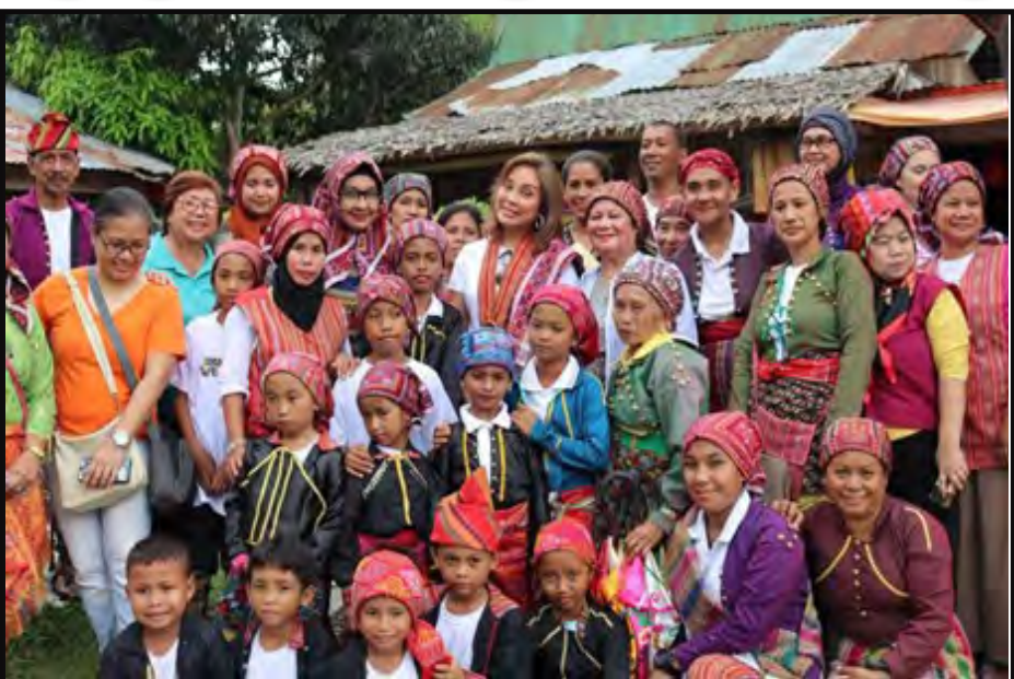
Mula tradisyon hanggang inobasyon: Legarda ginawaran ng Intellectual Property Champion Award- story p.3

ACCEPTING ADS, PLEASE CALL : 0977-7844136/ 0968-7122927