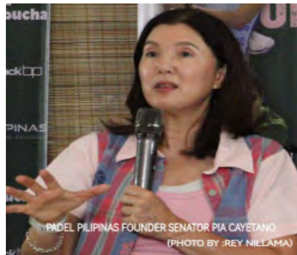
PADEL PILIPINAS FOUNDER SENATOR PIA CAYETANO

din ang dream ko sa padel na magpapa-tournament din sila