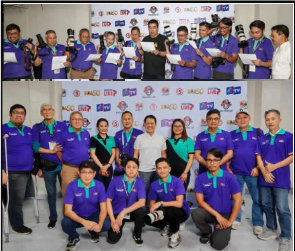
INDUCTION OF OFFICERS 2025 - 27 PBA PRESS PHOTOGRAPHER CLUB