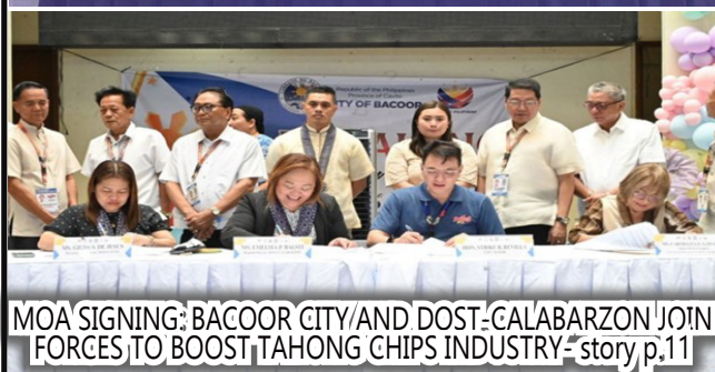
MOA SIGNING: BACOR CITY AND DOST-CALABARZON JOIN FORCES TO BOOST TAHONG CHIPS INDUSTRY- story p.11