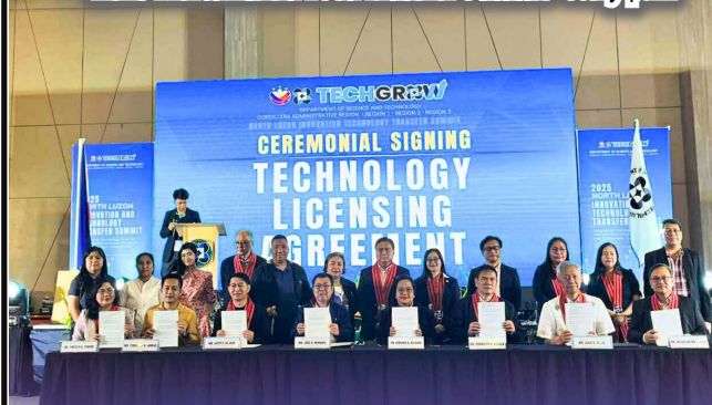
Region 02 Secures Licensing for Three Technologies at 2025 North Luzon Tech Transfer Summit- story p.11