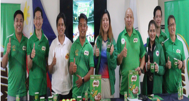
THUMBS UP SPORT OFFICIAL RE-SPORTS SUMMER CLINIC