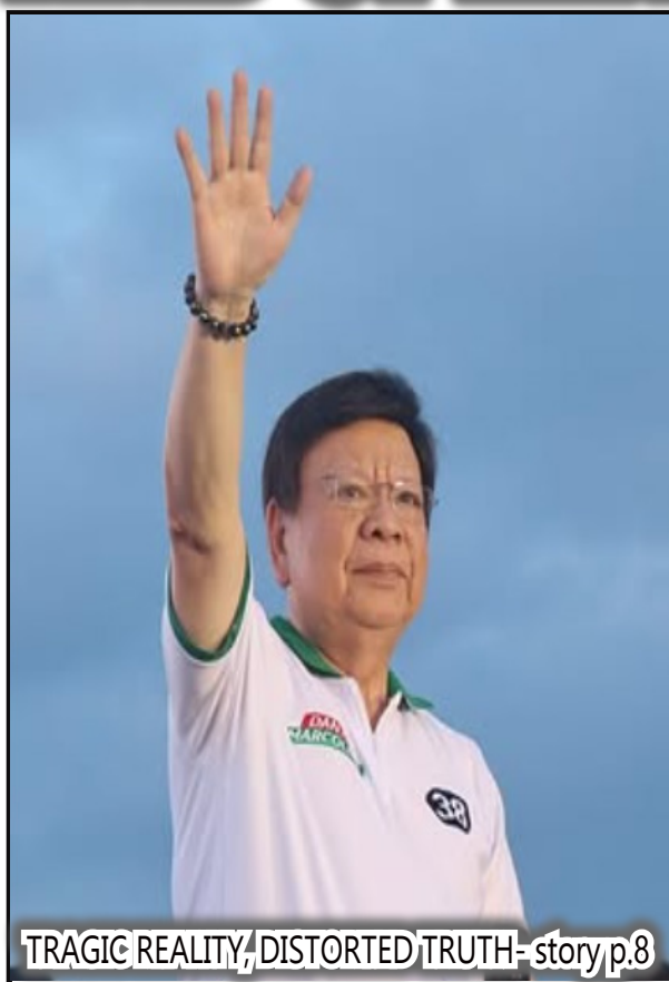
TRAGIC REALITY, DISTORTED TRUTH- story p.8