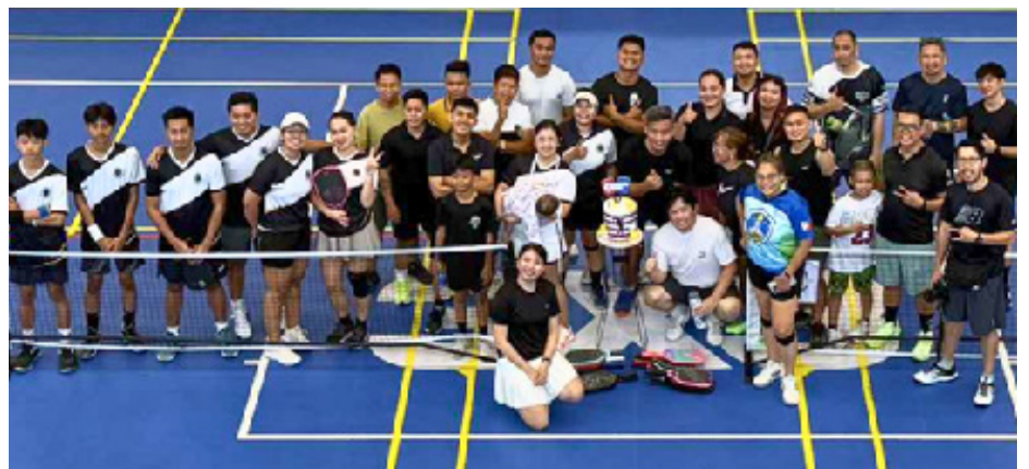
Pickleball groups in Cavite came together to experience the excitement of Pickleball at SM Active Hub in SM City Rosario, enjoying the sport in a fun and dynamic mall setting.

With Pickleball gaining popularity in the Philippines , having it at the mall makes it more accessible for players of all levels. Whether you're a pro or a beginner, SM Active Hub offers the perfect space to enjoy the game in a safe and welcoming environment.