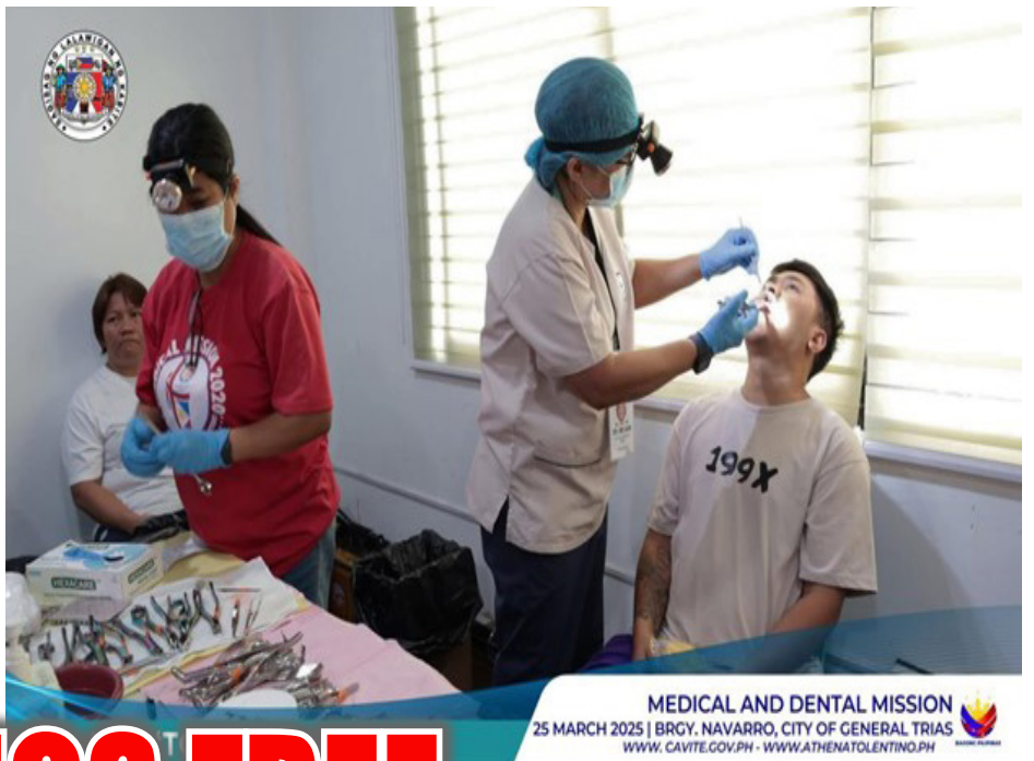
MEDICAL AND DENTAL MISSION 25 MARCH 2025 | BRCY. NAVARRO, CITY OF GENERAL TRIAS WWW.CAVITE.GOV.PH - WWW.ATHENATOLENTINO.PH