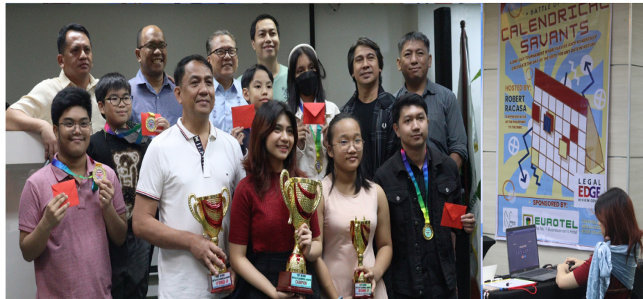
AWARDING CEREMONY 1ST BATTLE OF CALENDRIAL SAVANTS RACASA KAMPEON @ EUROTEL CUBAO QUEZON CITY