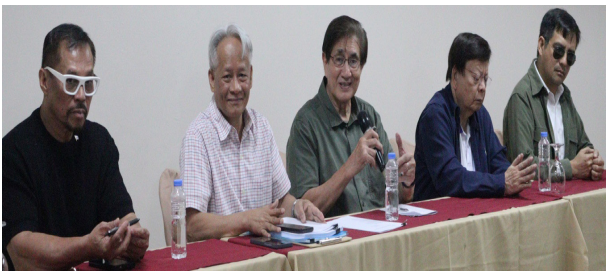
FORMER SENATOR GREGORIO HONASAN RODANTE MARCOLETA AND OTHERS