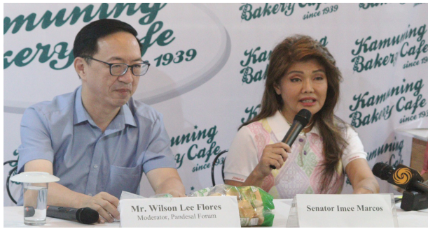
PANDESAL FORUM - SENATOR IMEE MARCOS NAG PALIWANAG SA PANDESAL FORUM

TINALAKAY ni Senator Imee Marcos sa Pandesal Forum sa Kamuning Bakery Cafe Quezon City Judges Jimenez Street. Ang hinggil sa isyung nakapaloob sa pagdinig sa Senado kaugnay ng pag kaka aresto sa dating Pangulo ng bansa na si Rodrigo Roa Duterte. Na ang imbestigasyon ay makatutulong sa batas na angkop sa panukalang batas sa abot ng Committee on Foreign Relations.