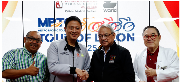
MPTC TOUR OF LUZON 2025 PARTNER

hanggang Clark sa Stage 4. Ang Sports Medicine Institute ay nagtataglay ng MVP Clinic na nag-aalok ng pinakabagong pangangalaga sa mga propesyonal at libangan na atleta mula sa paggamot at pag-iwas sa mga pinsala hanggang sa tamang kondisyon at nutrisyon. Kasama ang Lifestyle and Wellness Center ng ospital, ang isang kumpletong hanay ng parehong epektibong mga pakete ng programa sa paggamot at pag-unlad ay magagamit para sa lahat ng uri ng mga pasyente at atleta. Ang Stage 5 ay isang 120km ride na nagsisimula at nagtatapos sa Clark, Pampanga sa pamamagitan ng New Clark City sa Capas, Tarlac habang ang ikaanim na yugto ay magtatapos sa Lingayen, Pangasinan pagkatapos ng 150kms. Ang mga pili na siklista ay makikipagkumpitensya laban sa oras ng Individual Time Trial (30kms) sa Stage 7 bilang paghahanda sa 178-km na pag-akyat sa Camp John Hay sa Baguio City sa huling yugto kung saan ang kampeon ay kkoronahan.