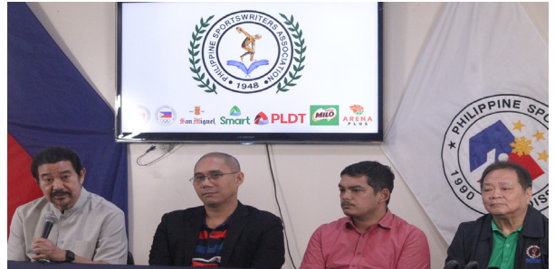
31ST NCRAA NATIONAL CAPITAL AND REGIONAL ATHLETICS ASSOCIATION