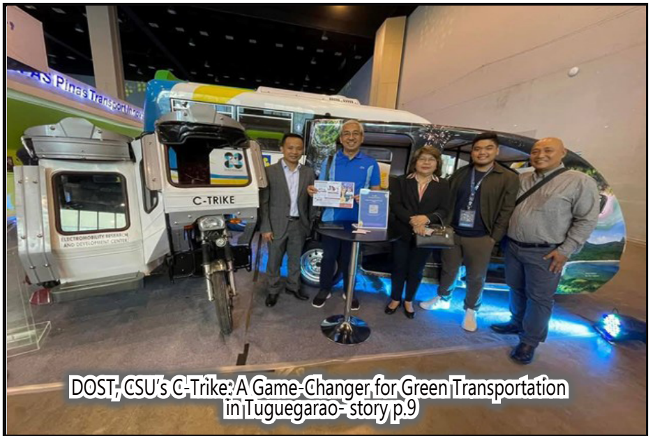
DOST, CSU's C-Trike: A Game-Changer for Green Transportation in Tuguegarao- story p.9