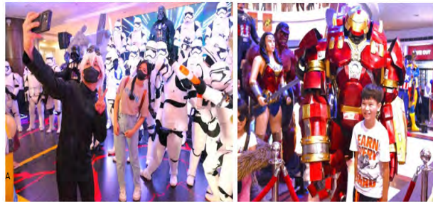
Fans immerse themselves in the excitement as they pose iconic movie characters.

Excitement reached a fever pitch as toy collectors gathered at SM City Bacoor for the highly anticipated launch of Toy Fezt 2.0. From June 8 to 22, the mall's Event Center transformed into a spectacular showcase from two esteemed artists famous for their fan-made, life-sized, and larger-than-life action figures, offering