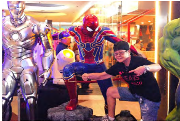
Embracing the superhero spirit, this senior shopper enjoys the thrill brought by his favorite character at the exhibit.