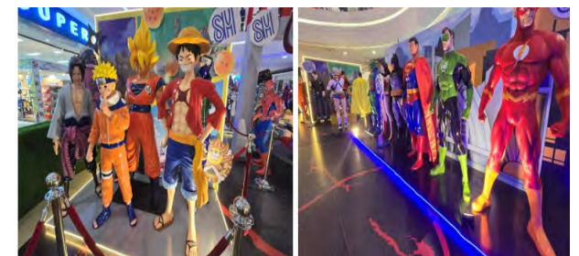
These anime classics from your favorite Japanese cartoons are also showcased at the exhibit.