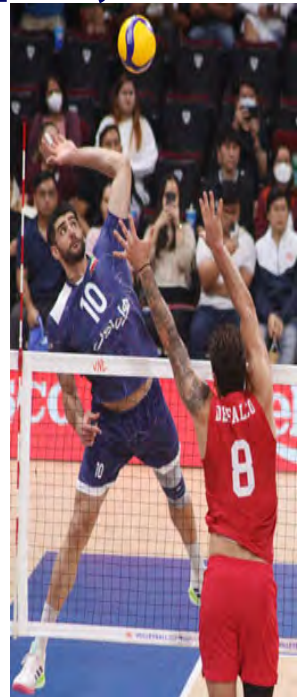
VNL VOLLEYBALL NATION LEAGUE IRAN VS USA

ILAN lamang sa umaatikbang aksyon sa Volleyball Nation League Men's Volleyball ng mag harap ang Iran at United States of America kung saan tinalo ng Iran ang USA. (REY NILLAMA)