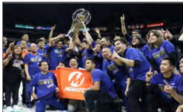
SA Kauna-unahang pagkakataon nakamit ng walang kasing saya ang koponang Meralco Bolts ng masungkit nito ang kampeonato makaraang biguin ang San Miguel Beermen sa kanilang laban sa season 48 PBA Philippine cup finals game 6 best of seven series sa Araneta Coliseum.

Nagsisilbing panimula para sa grand solo hosting ng FIVB ang VNL Men's Tournament sa Mall of Asia ngayong linggo. Kabilang sa mga kalahok sa tournament ay ang mga fan-favorites tulad ng Japan, USA, Brazil, Germany, France, at Canada.