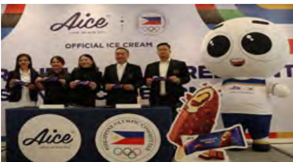
GROUP PHOTO AFTER MOA SIGNING AICE TO POC