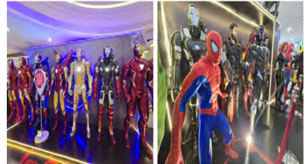
A stunning display of superhero suits are exclusively displayed at the Toy Fezt 2.0. This collection will be travelling at SM Malls in South Luzon until 2025.