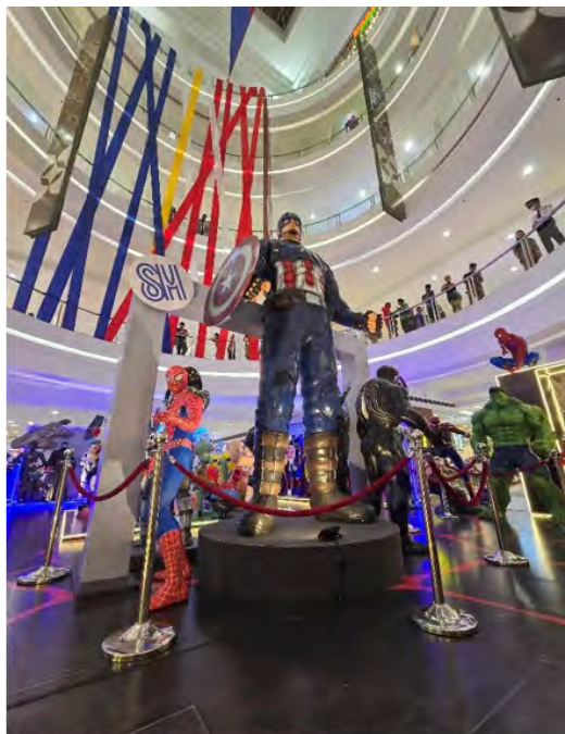
Along with the iconic characters and anime classics stood this 14ft Superhero figure which steals the scene and captures the attention of the shoppers. This gigantic action figure will be exclusively displayed at SM City Bacoor's Event Center from June 8 to 22 only.