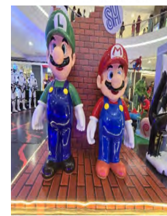
ated no more, these iconic brothers stand ready for shoppers of all ages visiting the exhibit.

The anticipation peaked at the first zap of Toy Fezt 2.0, where heroes awaited at SM City Bacoor. Enthusiasts from all over the South, including those who are in Bicol Region, are invited to join this ultimate celebration of fandom as another toyverse of collectibles displayed at SM City Sorsogon. This exhibit will continue to travel from SM City Bacoor to all SM malls in South Luzon until 2025. Next stop is SM City Sta.Rosa, so watch out! Don't miss out on this unique opportunity to immerse yourself in the world of action figures and collectibles. Be part of the excitement and celebrate your favorite characters at Toy Fezt 2.0!