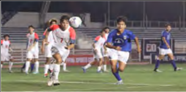
FOOTBALL FRIENDSHIP GAME PHILIPPINE VS ITALY SELECTION FOOTBALL FRIENDSHIP GAME - ang ilan lamang sa naging maasyong tagpo sa pagitan ng Philippine under 19 National Pool at ng Italy Selection sa kanilang mahigpit na tagisan sa ginanap na football friendship games sa Rizal Memorial Sports football field kung saan tinalo sa iskor na 5-3 ang National pool kontra selection. Ang friendly football match ay parte ng serye sa pagdiriwang ng National Day of Italy 2024.