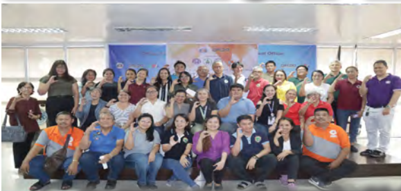
Capacity Building Seminar for Cooperatives: Orientation on Intellectual Property--- story p.2