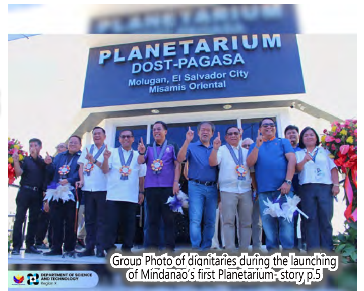
Group Photo of dignitaries during the launching of Mindanao's first Planetarium- story p.5

ACCEPTING ADS, PLEASE CALL: 0977-7844136/ 0968-7122927