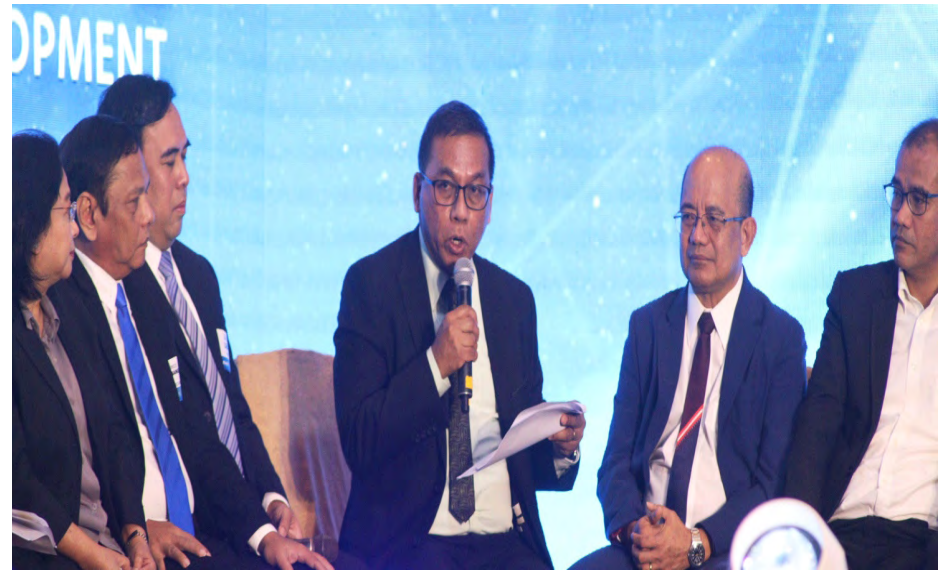
DOST SECRETARY RENATO SULIDOM JR

Level up your Valentine's celebration with extra fun and sweetness! Get an "In Love with You" quote tag from Tom's World at SM City Tanza and make your V-Day moments even more special. Valentine's Day isn't just about one day—it's about making every moment count. So, whether you're here for romance, self-love, or just a good time, SM Malls in Cavite are where love happens!