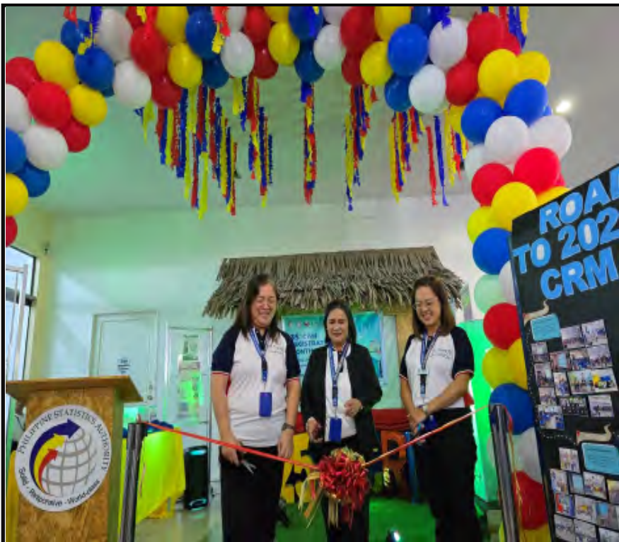
PSA RSSO IV-A Leads the Way: Celebrating 35 Years of Strengthening Civil Registration- story p.8