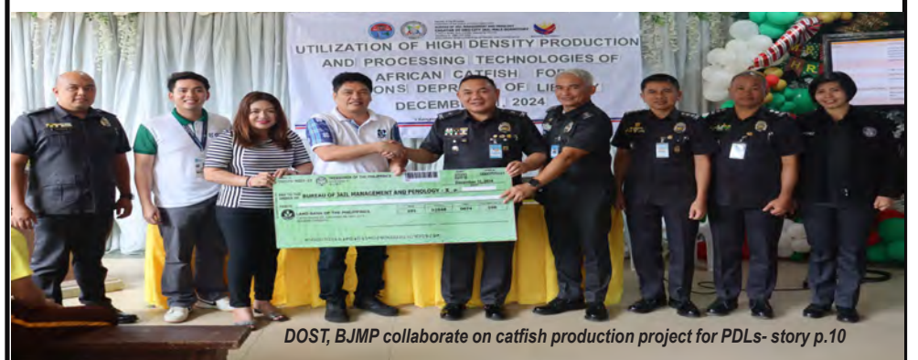
DOST, BJMP collaborate on catfish production project for PDLs- story p.10

ACCEPTING ADS, PLEASE CALL : 0977-7844136/ 0968-7122927