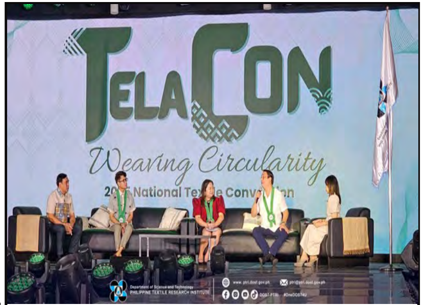
DOST-PTRI Pushes for Innovation and Collaboration at TELACon 2025- story p.5