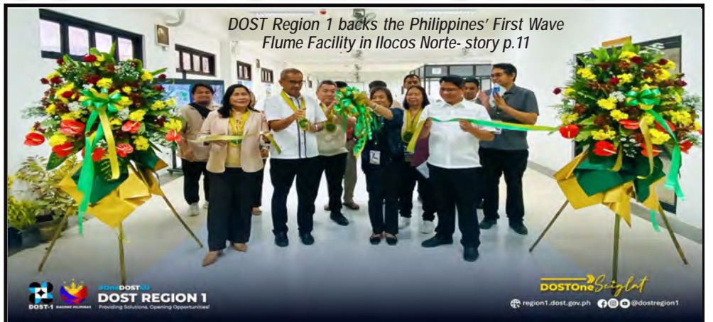
DOST Region 1 backs the Philippines' First Wave Flume Facility in Ilocos Norte- story p.11