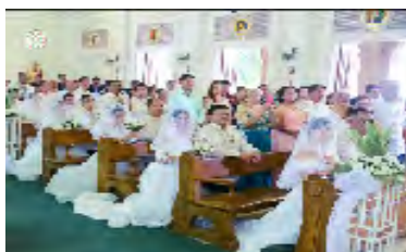
16 couples, including members of the SM SuperMoms Club Facebook community, SM employees, and members of the public, participate in the mass wedding.