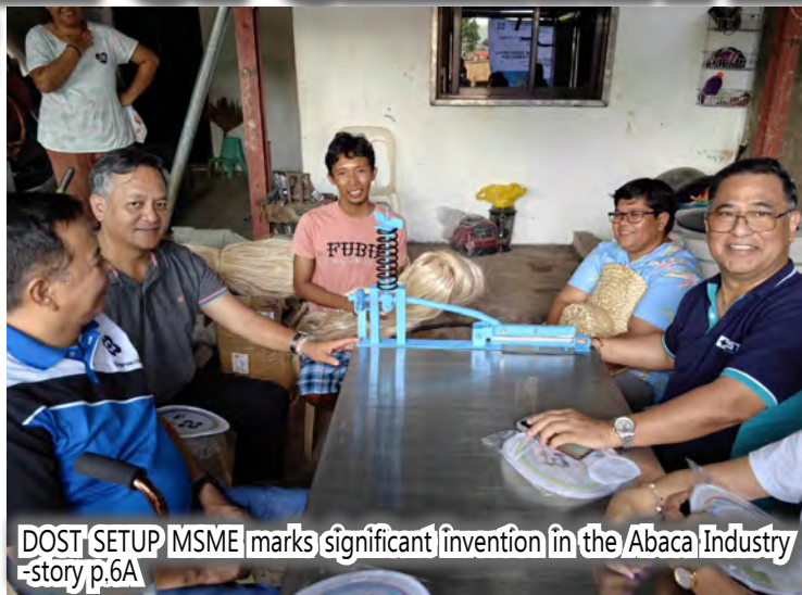
DOST/SETUP/MSME marks significant invention in the Abaca Industry -story p.6A