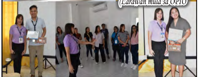
Provincial Government of Cavite Holds Partnership-Building Event to Strengthen Stakeholder Collaboration -story p.2