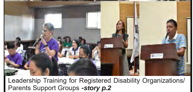
Leadership Training for Registered Disability Organizations/ Parents Support Groups -story p.2

ACCEPTING ADS, PLEASE CALL: 0977-7844136/ 0968-7122927