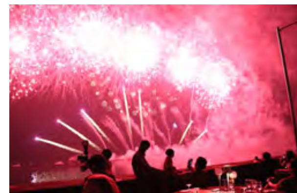
PYROMUSICAL FIREWORKS COMPETITION @ MOA BY THE BAY

BAHAGI lamang ito sa naging kaganapan ng kumpetisyon sa ginanap na The Philippine International Pyromusical Competition sa SM by the bay, Pasay City kung saan nag tagisan ang bansang kalahok na Australia at South Korea.