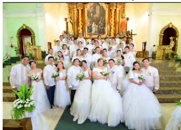
SM Supermalls and the Felicidad T. Sy Foundation, Inc. (FTSFI) bring together 16 couples, including SM SuperMoms, at the heartwarming 8th Kasalan sa SM mass wedding.

members of their 296,000-member Facebook community, the SM SuperMoms Club, making the day even more heartwarming.