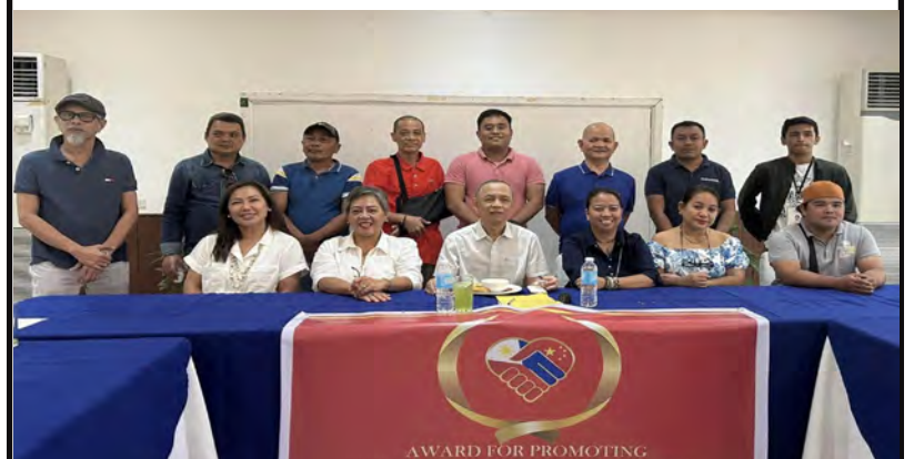
The Association for Philippines-China Understanding (APCU) holds a Press Briefing for members of the Cebu City Media May 16 on its project the Awards for Promoting Philippines-China Understanding (APPCU), now on its 4th year giving recognition to Filipinos with outstanding work in building friendship between the two nations.