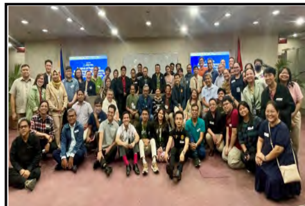
Batas para sa Propesyonalisasyon ng mga Tagasaling Pilipino, isinusulong ng Kasálin Network - story p.6D

Tandaan natin ang WILD bilang pangontra at panlaban.