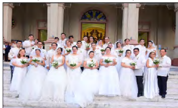
The 8th Kasalan sa SM, a heartwarming mass wedding, is held at the Shrine of Jesus the Way, the Truth and the Life Church in Pasay City.