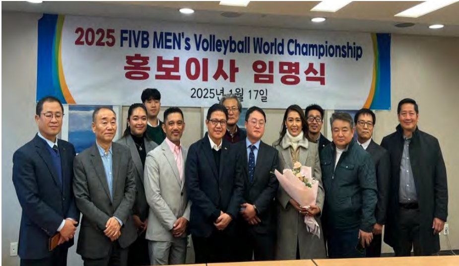
2025 FIVB PHIL OFFICIAL HOSTING WITH KOREAN MARKETING AND PROMOTIONS

Ang Pool B ay sa Poland, Netherlands, Qatar at Romania, habang ang US ay naglalaro sa Pool D laban sa Cuba, Portugal at Colombia. Ang Slovenia, Germany, Bulgaria at Chile ay naglalaro sa Pool E, habang ang Pool G ay para sa Japan, Canada, Türkiye at Libya. Ang Brazil ay nasa pool H kasama ang Serbia, Czechia at China.