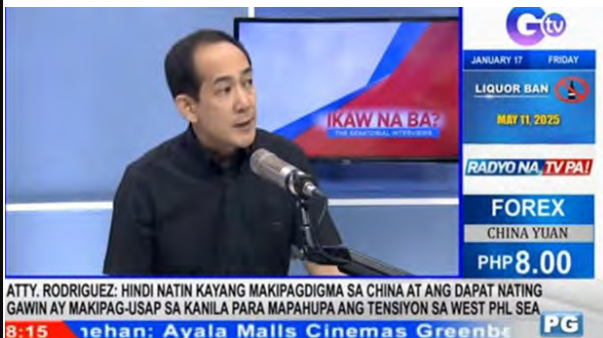
Senatorial Aspirant Rodriguez Advocates for Diplomatic Solutions, Anti-Corruption Laws, and Economic Reforms- story p.8