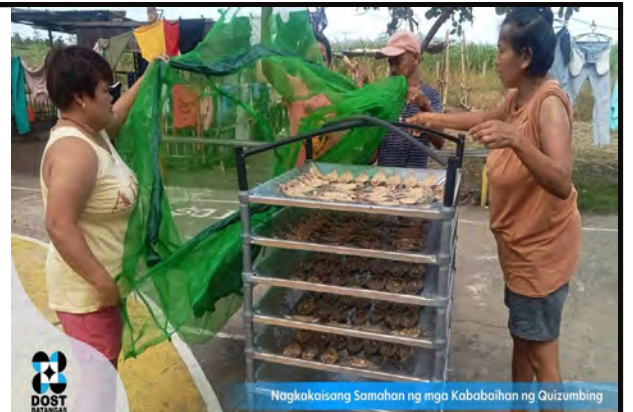
Portasol solar dryers from DOST to boost livelihood activities in Batangas- story p.8