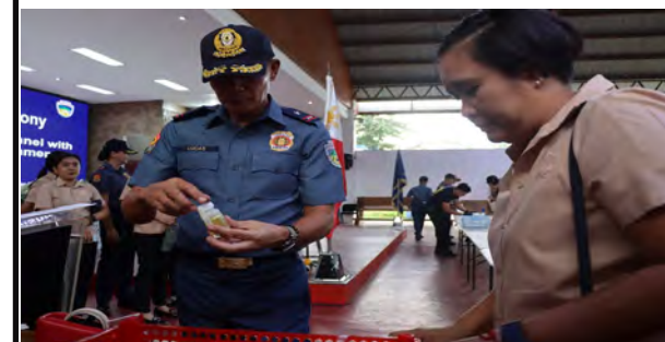
PRO CALABARZON CONDUCTS SURPRISE DRUG TEST, ENSURING A DRUG FREE WORKPLACE- story p.2