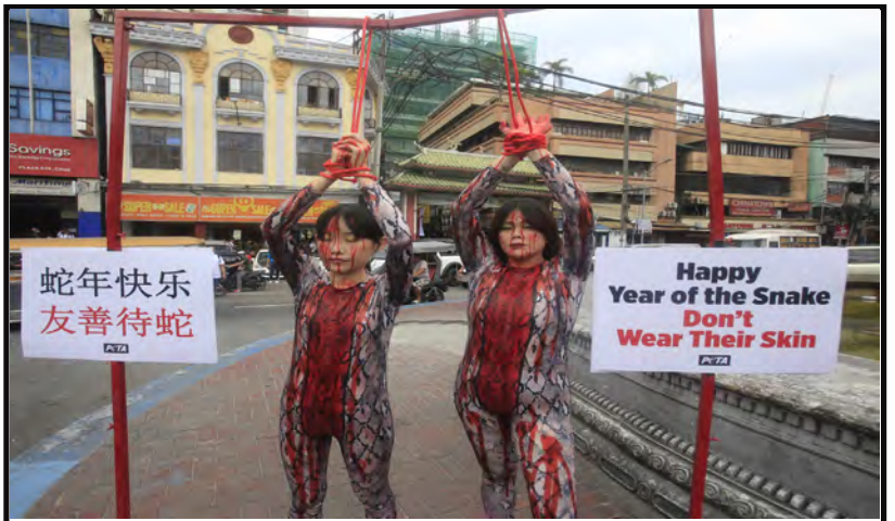
PETA - PRODUKTONG GAWA SA BALAT NG HAYOP WAG TANGKILIKIN

Nakasuot ng snake costumes, itinali ng mga miyembro ng People for the Ethical Treatment of Animals (PETA) ang kanilang mga kamay sa poste malapit sa Carried Fountain ng Sta Cruz Manila pinakikita sa publiko na huwag bumili o suportahan ang anumang produktong gawa sa balat ng mga hayop lalo na sa balat ng ahas. (REY NILLAMA)