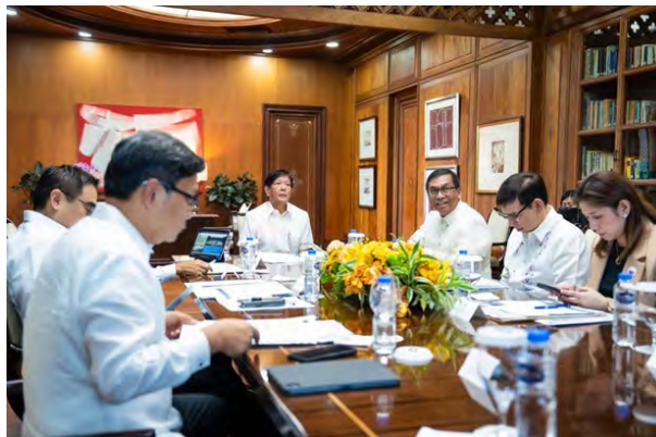
PBBM vows funding for building of PH institute for virology, vaccine- story p.8