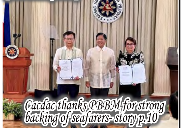
Cacdac thanks PBBM for strong backing of seafarers- story p.10