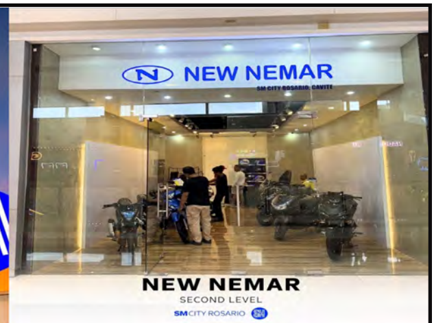
NEW NEMAR SECOND LEVEL SM CITY ROSARIO