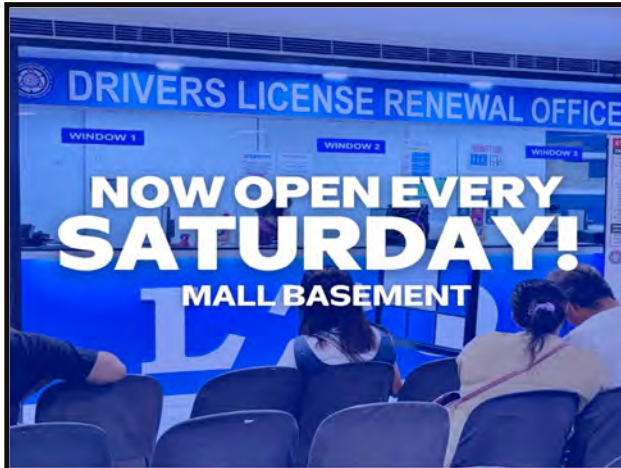
SM CITY TRECE MARTIRES

clerks, Focal Persons, Public Information Officers (PIOs), and Social media handlers from all Police Provincial Offices (PPOs) and the Regional Mobile Force Battalion (RMFB) 4A. This gathering was a crucial step in ensuring cohesive coordination among the various units involved in community affairs and development efforts, aimed at promoting the well-being of local communities across the region. The conference also provided an opportunity for participants to discuss and align strategies, exchange best practices, and enhance their collaborative efforts in addressing the evolving needs of the public.