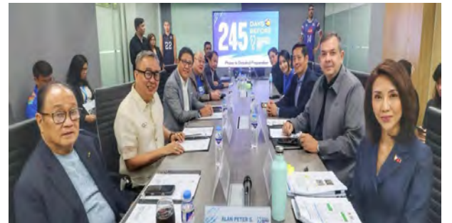
FIVB MEMBERS LOCAL ORGANIZING COMMITTEE