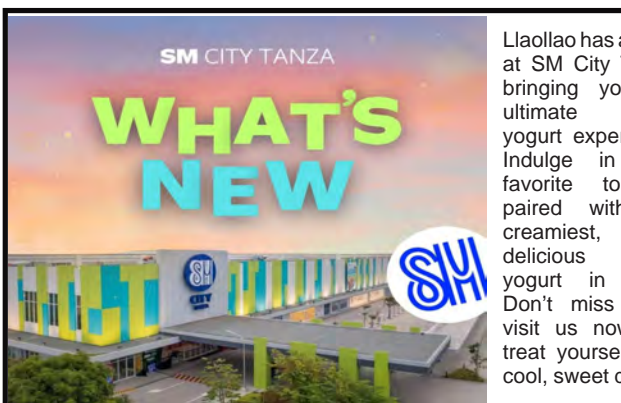
SM CITY TANZA

Llaollao has arrived at SM City Tanza, bringing you the ultimate frozen yogurt experience! Indulge in your favorite toppings paired with the creamiest, most delicious frozen yogurt in town. Don't miss out—visit us now and treat yourself to a cool, sweet delight!