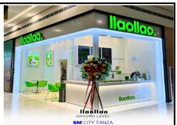
llaollao GROUND LEVEL SM CITY TANZA

Llaollao has arrived at SM City Tanza, bringing you the ultimate frozen yogurt experience! Indulge in your favorite toppings paired with the creamiest, most delicious frozen yogurt in town. Don't miss out—visit us now and treat yourself to a cool, sweet delight!