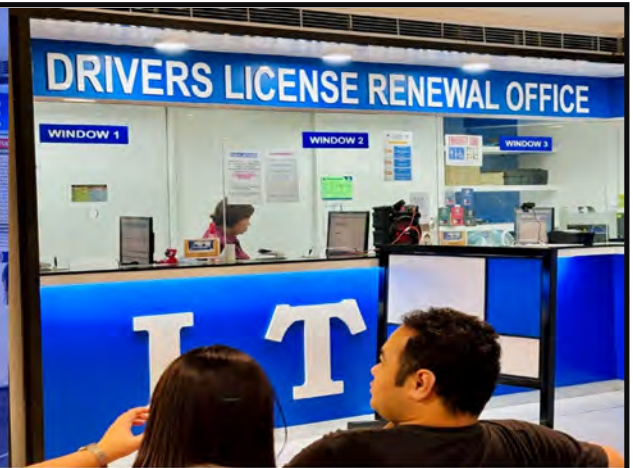
SM CITY TRECE MARTIRES