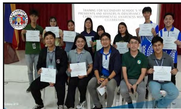
ATIN 'TO! AT YOUR SERVICE

Through PROPEL, DOST sets its sights on a brighter future, where Filipino science, technology, and innovation serve as engines for transformative growth, both in the Philippines and on the global stage.