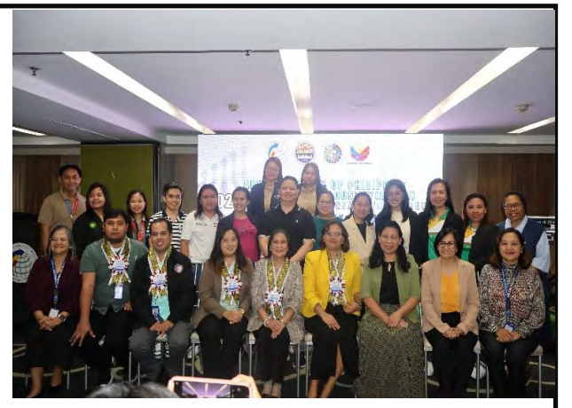
2022 ASPBI REGIONAL DATA DISSEMINATION FORUM AND 2024 QSPBI REGIONAL RESPONDENTS' FORUM- story p.5

ACCEPTING ADS, PLEASE CALL : 0977-7844136/ 0968-7122927