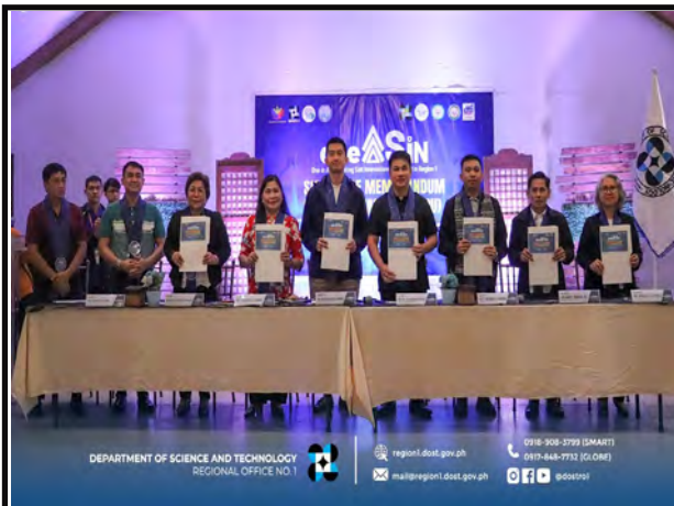
DOST 1's OneASIN Ushers in New Era for Ilocos Norte Salt Industry- story p.4