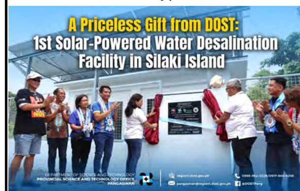
A Priceless Gift from DOST: 1st Solar-Powered Water Desalination Facility in Silaki Island- story p.8