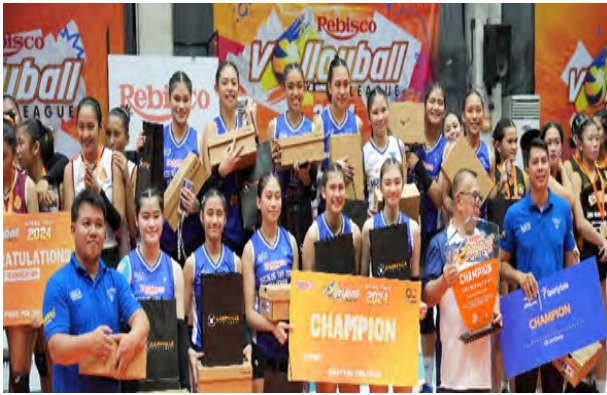
Bacolod Tay Tung, ipinagtanggol ang National title ng Rebisco Volleyball League MVP Almendralejo