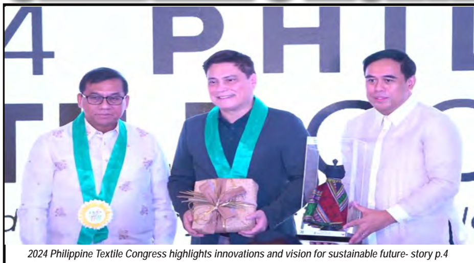
2024 Philippine Textile Congress highlights innovations and vision for sustainable future- story p.4