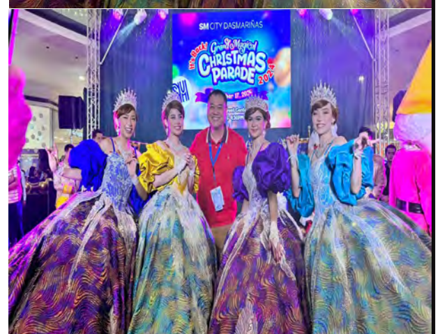
SM Supermalls in Cavite Grand Magical Christmas Parade Spreads Festive Spirit at SM City Dasmariñas The Grand Magical Christmas Parade spreads festive spirit at SM City Dasmariñas, following its successful debut at SM City Bacoor. Featuring over 80 enchanting characters, including Santa, elves, reindeer, and fairy-tale royalty, the parade brings seasonal joy to families, friends, and shoppers. The celebration will continue across SM malls in South Luzon. For updates and highlights, visit and follow SM City Dasmariñas' social media accounts.