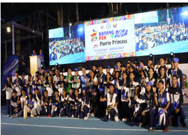
BATANG PINOY NATIONAL CHAMPIONSHIPS 2024 OVER ALL CHAMPION PASIG TEAM