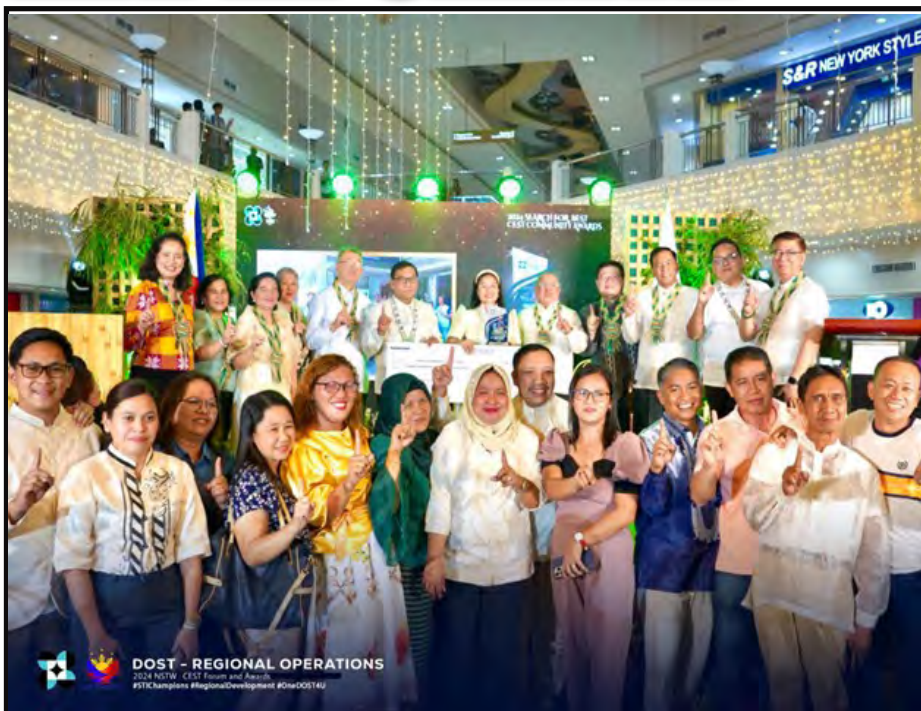
Congratulations to the Rural Community of M'Lang of DOST Region 12 for winning the Best CEST Community Award, during NSTW at Cagayan de Oro City: The Best Community Empowerment thru Science and Technology (CEST) Community Award aims to recognize the exemplary performance of local communities as partners in implementing science and technology-based projects in their locality.