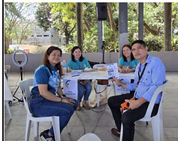
PSA Help Desk Addresses Various Inquiries on Civil Registry Document concerns at Overseas Job Fair Caravan- story p.2