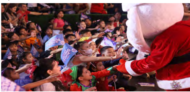
The excitement is palpable as young and old alike gather to catch a glimpse of Santa and his cheerfull companions, each ready to create and capture lasting memories at SM City Bacoor.

Dazzling Moments at SM City Dasmariñas The holiday magic hops and doesn't stop! The celebration continued from SM City Bacoor to SM City Dasmariñas as the mall host its own Grand Magical Christmas Parade. Shoppers and their families were delighted with a lively display as these characters march through the mall, spreading joy and the true spirit of the holiday season.