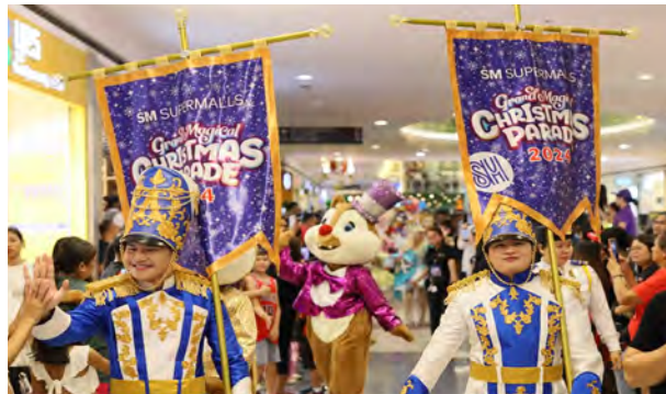
The Grand Magical Christmas Parade continues at SM City Dasmariñas, bringing festive cheer and holiday magic to shoppers around the mall

Dazzling Moments at SM City Dasmariñas The holiday magic hops and doesn't stop! The celebration continued from SM City Bacoor to SM City Dasmariñas as the mall host its own Grand Magical Christmas Parade. Shoppers and their families were delighted with a lively display as these characters march through the mall, spreading joy and the true spirit of the holiday season.