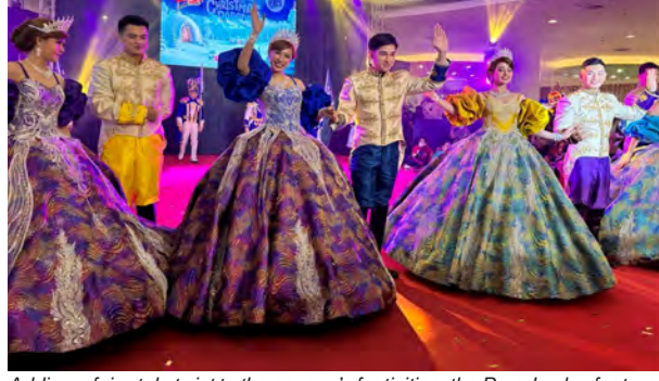
Adding a fairy-tale twist to the season's festivities, the Parade also features beloved Prince and Princesses. Clad in their royal attire, these royalties bring an extra touch of magic, inviting families into a world of enchantment.