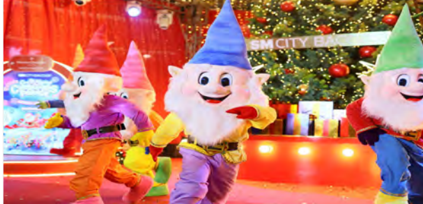
These joyful dwarves added fun and excitement to the kids during their performance.