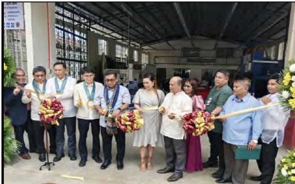
Technology and Resilience Take Center Stage in DOST 9 RSTW- story p.11