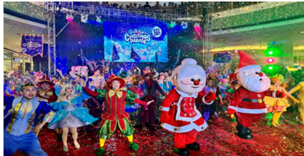
The Grand Magical Christmas Parade concluded with a festive dance featuring all the characters.

The Spirit of Christmas Across South Luzon The magic of the SM Supermalls Grand Magical Christmas Parade will continue across various SM Supermalls in South Luzon, bringing joy to families all over the region and a chance to experience the warmth and wonder of Christmas. So mark your calendars and bring your loved ones for a celebration that's sure to be unforgettable! The Grand Magical Christmas Parade is more than just an event; it's a joyful experience filled with magic, laughter, and the warmth of holiday togetherness. Don't miss out on this magical holiday celebration—it's Christmas, the SM Supermalls way!