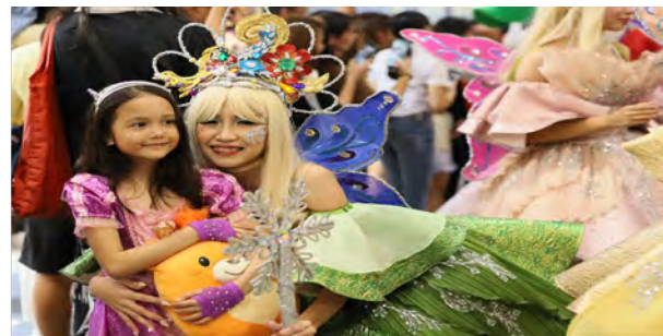
The fairies at the Grand Magical Christmas Parade delight kids with magical moments.