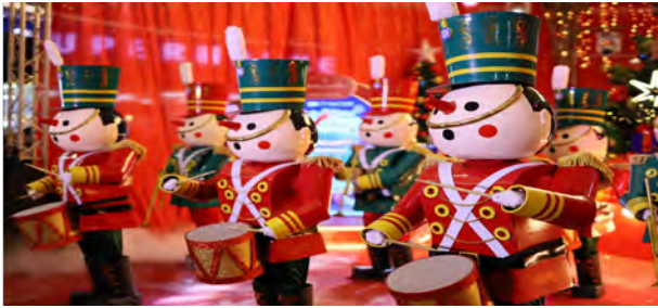
Bringing the beat of Christmas are these toy drummer boys coming to life.

Kicking off at SM City Bacoor, this year's SM Supermalls Grand Magical Christmas Parade brings together over 80 beloved Christmas characters, from Santa Claus and his joyful elves to reindeer and classic Christmas favorites.