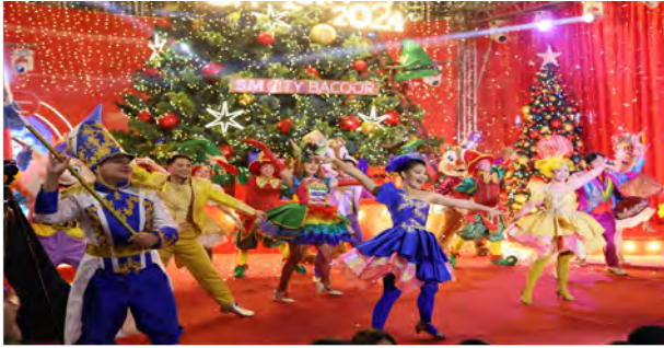
Vibrant Christmas characters and enchanting performances filled the air with joy and festive cheer with the highly anticipated SM Supermalls Grand Magical Christmas Parade at SM City Bacoor.

The holidays just got brighter in the South! SM City Bacoor and SM City Dasmariñas recently launched the highly anticipated SM Supermalls Grand Magical Christmas Parade, bringing festive cheer to the community after a five-year long wait. This much-anticipated event, a holiday favorite for shoppers, families and friends, brings a spectacular experience of vibrant colors, enchanting music, and the heartwarming magic of Christmas.