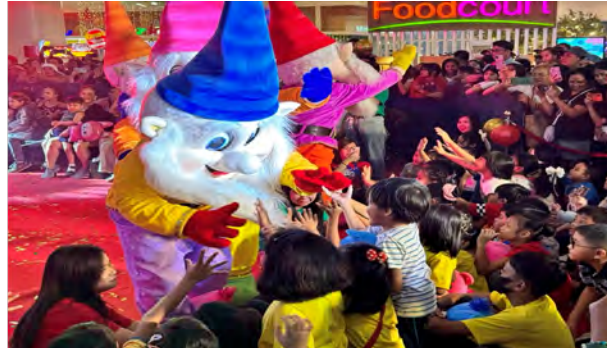
Kids were excited as they get to meet these magical characters during the Grand Magical Christmas Parade.