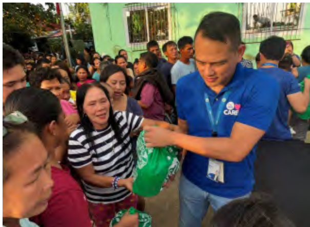
The woman from Kawit, Cavite, receives a Kalinga pack handed to her by the Mall Manager of SM City Rosario.