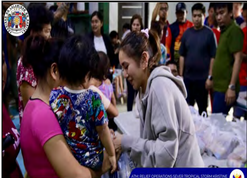
ATM: RELIEF OPERATIONS SEVER TROPICAL STORM KRISTINE OCT 25, 2024 | TEJERO ELEM SCHOOL, CENTRI CAVITE