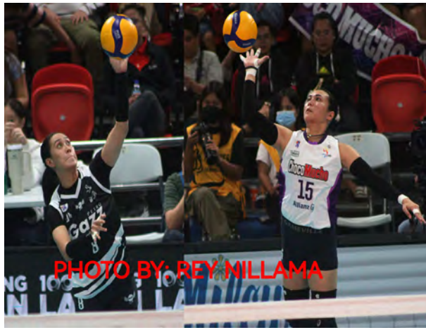
PREMIER VOLLEYBALL LEAGUE ALL FILIPINO CONFERENCE IN ACTION PETRO GAZZ VS CHOCO MUCHO

internasyonal na iskedyul ng FIVB. Habang sabik na naghihintay ang mga fans sa first serve, ang spotlight ay sa kapana panabik na main game sa ganap na 6:30 ng gabi, kung saan magsisimula ang redemption arc ng last conference na si Choco Mucho laban sa Petro Gazz sa Philsports Arena sa Pasig. Ang Flying Titans ay titingin upang mag bukas ng pahina sa isang mahusay na huling season, habang ang Angels, isang dalawang beses na Reinforced champion, ay pantay na determinado na mag bounce back pagkatapos yumuko sa round robin semifinals sa huling oras.