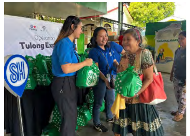
Nanay from Rosario, Cavite, takes home not just the Kalinga pack, but also the hope and joy that Operation Tulong Express initiative brings to her community.