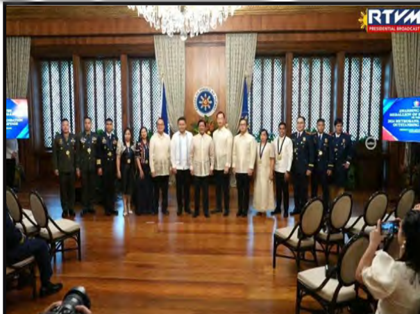
PBBM to Metrobank awardees: Stay as catalyst of change- story p.9