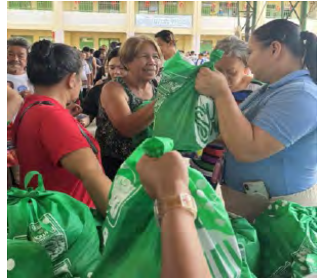
An elderly resident from Noveleta, Cavite, happily receives a Kalinga pack.