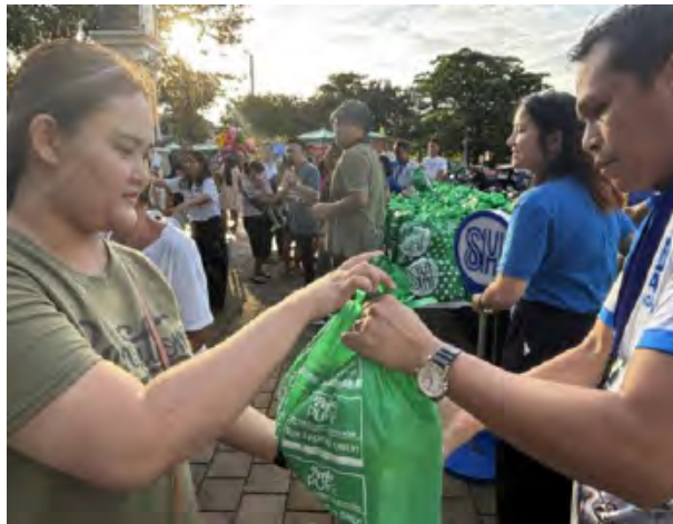
A Kalinga pack is being handed by an SM City Rosario employee to a woman residing in Cavite City.

More than 3,000 Kalinga packs were distributed in total by SM City Rosario to families affected by Typhoon Kristine across several towns, including Noveleta, Cavite, through SM Cares' Operations Tulong Express program. In addition to Noveleta, Kalinga packs were also provided to families in Cavite City, Kawit, and Rosario, Cavite. This generous effort highlights SM's commitment to supporting communities in times of crisis and helping families rebuild their lives.