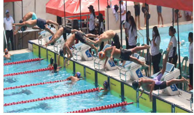
PAI - SPEEDO SWIM SERIES LEG 2 SWIMMER PARTICIPANTS

Melencio nanguna sa MOS awardees ng PAI-Speedo Swim Series 2