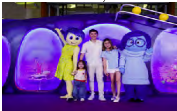
Joy fills the air as families experience a meet-and-greet with "Inside Out 2" characters at SM Seaside City Cebu.

Children and adults alike lined up for unforgettable photos with the lovable characters. The event was a heartwarming reminder of the power of emotions and the importance of finding balance in our lives.