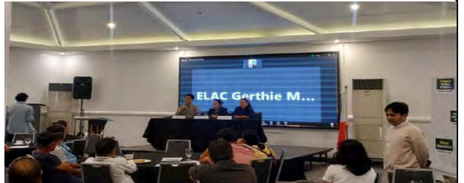
Media Forum on Local Autonomy and Mining- story p.10

ACCEPTING ADS, PLEASE CALL : 0977-7844136/ 0968-7122927