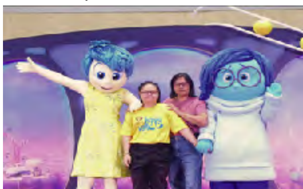
A special fan has the chance to meet their favorite characters from "Inside Out 2" at SM City North EDSA.