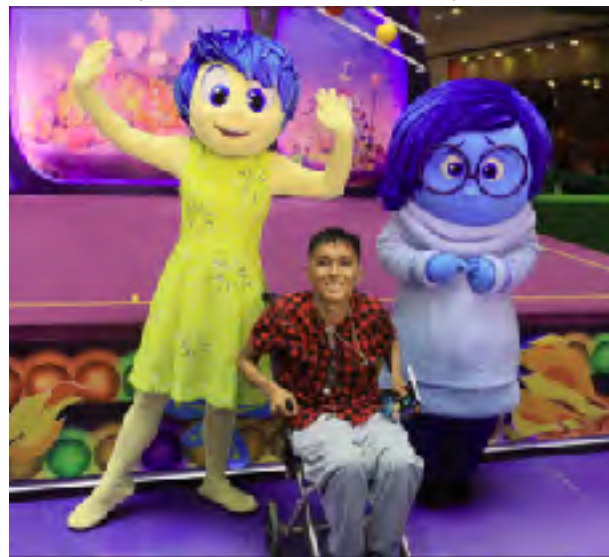
Joy and Sadness know no bounds—a beautiful celebration of every story and experience at SM City Dasmariñas.

"Inside Out 2," the 2024 sequel, is now available on Disney+ with a Filipino-dubbed version. Relive the magic of the film and discover the heartwarming story of 13-year-old Riley and her new emotions, such as Anxiety, Envy, Ennui (boredom), and Embarrassment.