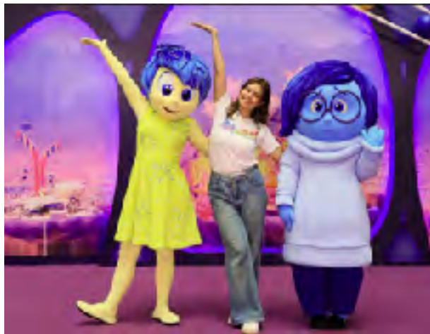
Joy and Sadness unite with the lively spirit of Kidz Groove, celebrating the dance of emotions at SM City Dasmariñas.