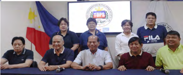
TOPS USAPANG SPORTS - MANILA FINEST GOLF CUP TOURNAMENT