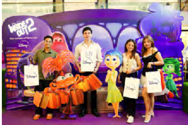
Cebuanos attend the "Inside Out 2" activation at SM Seaside City Cebu.

Fans of the beloved Disney and Pixar film "Inside Out 2" had the opportunity to create lasting memories with their favorite characters at SM Supermalls. Joy and Sadness, the iconic duo from the film's original five-personified emotions (the others being Anger, Fear, and Disgust), made special appearances at SM Seaside City Cebu on October 3, SM City North EDSA on October 5, and SM City Dasmariñas on October 6.