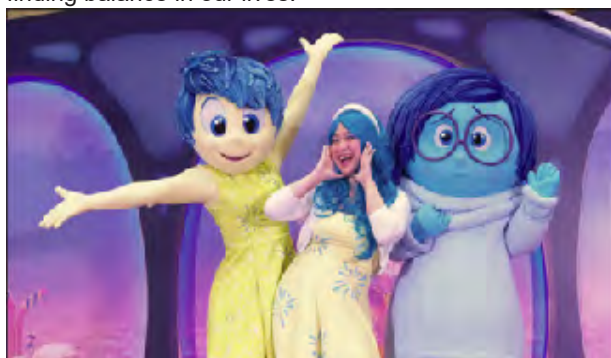
A fan embraces their inner Joy with a blue wig at the "Inside Out 2" event at SM City North EDSA.

Children and adults alike lined up for unforgettable photos with the lovable characters. The event was a heartwarming reminder of the power of emotions and the importance of finding balance in our lives.