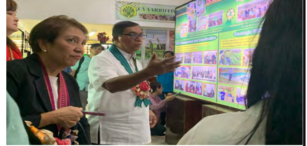
Embryo Transfer Technology, a new era in goat farming in Cagayan Valley- story p.5

ACCEPTING ADS, PLEASE CALL: 0977-7844136/0968-7122927