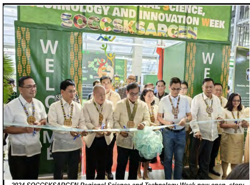
2024 SOCCSKSARGEN Regional Science and Technology Week now open-story p.2