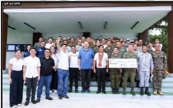
PRESIDENTIAL VISIT. President Ferdinand R. Marcos Jr. and Defense Secretary Gilberto Teodoro Jr. visit the Camp Navarro General Hospital (CNGH) in Zamboanga City on Thursday (May 9, 2024). The President turned over nearly a PHP81-million donation from the Office of the President to help improve the military hospital's services. --- story p.8