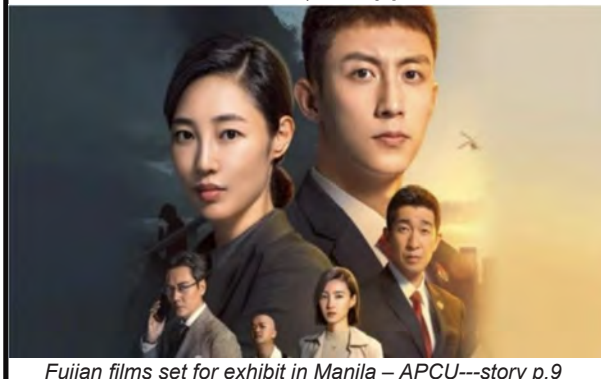
Fujian films set for exhibit in Manila – APCU---story p.9