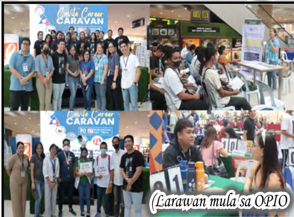
Career Caravan – GTC---story p.4