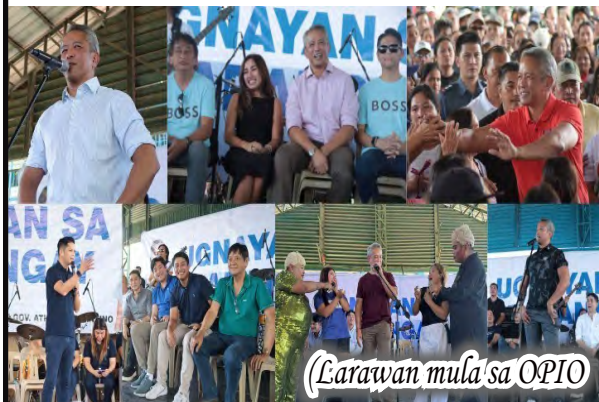
PGC's Ugnayan sa Barangay program brings hope and cheer to Cavite communities---story p.5