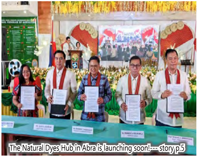
The Natural Dyes Hub in Abra is launching soon!--- story p.5