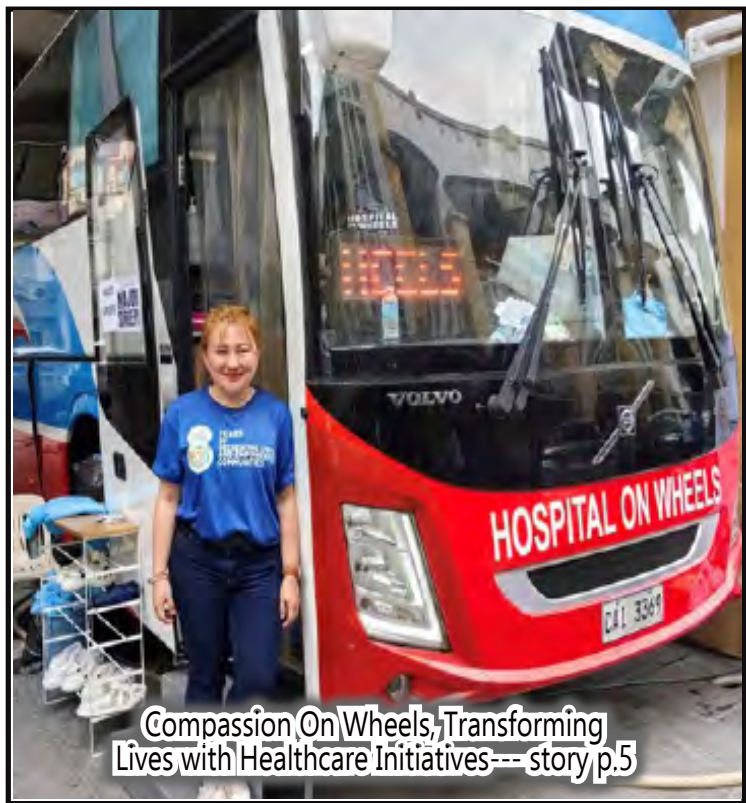
Compassion On Wheels, Transforming Lives with Healthcare Initiatives--- story p.5

TRAGEDY. The oil spill off Limay, Bataan was already in Barangay Amaya 5, Tanza, Cavite as of July 30, 2024. The Bureau of Fisheries and Aquatic Resources on Tuesday (Aug. 13) said fish and shellfish from the coastal waters of Cavite province remain unfit for human consumption in the aftermath of the sinking of three motorized vessels.