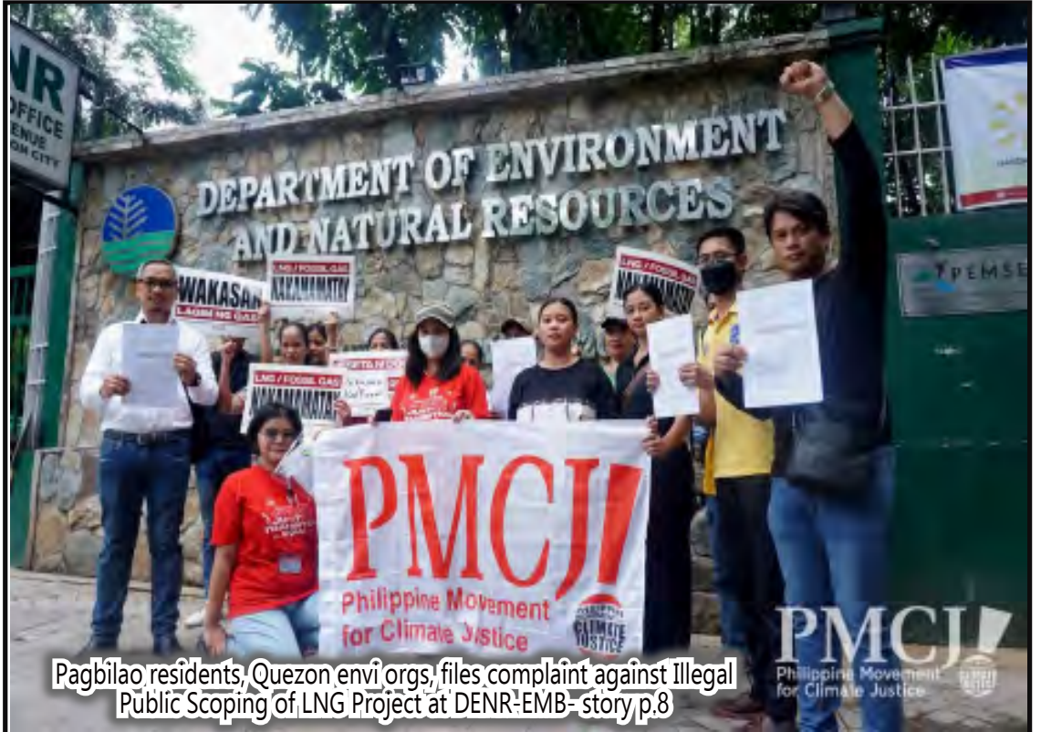
Pagbilao residents, Quezon envi orgs, files complaint against Illegal Public Scoping of LNG Project at DENR-EMB- story p.8

ACCEPTING ADS, PLEASE CALL : 0977-7844136/ 0968-7122927