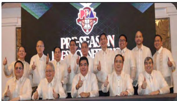
PBA 49TH PRE-SEASON PRESSCON @ SHANGRI-LA HOTEL EDSA MANDALUYONG