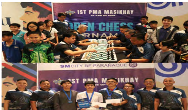
OPENING CEREMONY AND AWARDING 1ST PMA MASIKHAY RAPID CHESS TOURNAMENT