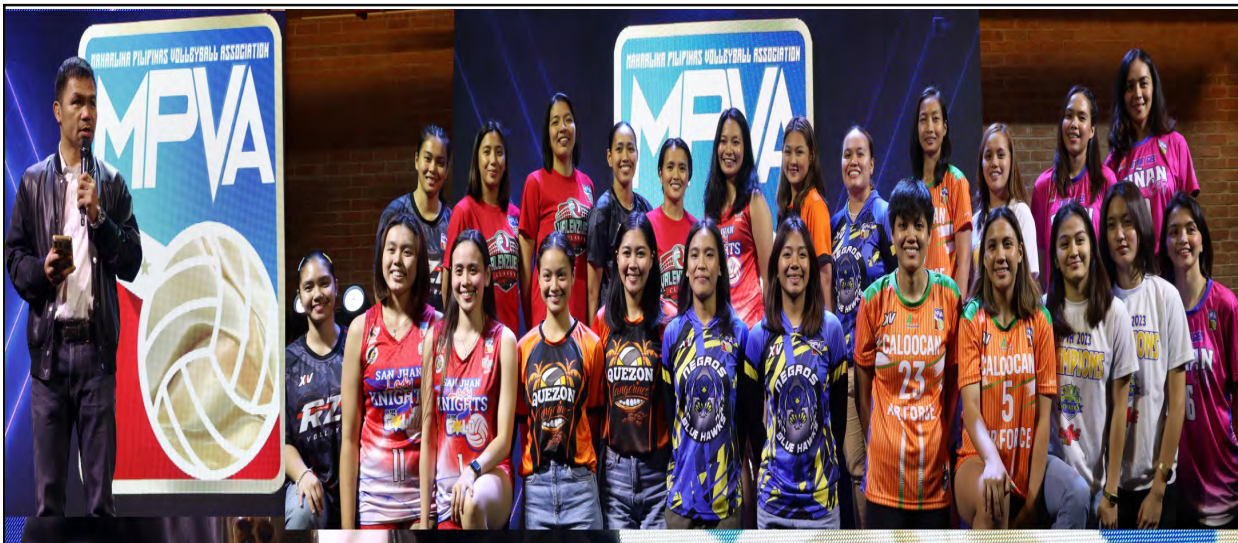
MPVA MAHARLIKA PILIPINAS VOLLEYBALL ASSOCIATION'S SEASON 1 PRESS CONFERENCE

Madalas na nagiging viral ang mga paskil na ito na matatagpuan sa FB page ng KWF. Kaugnay ang mga proyektong ito sa adhika ng KWF na maipalaganap at mapaulad pa ang wikang Filipino sa pamamagitan ng mga impormatibo at malikhaing kampanya.