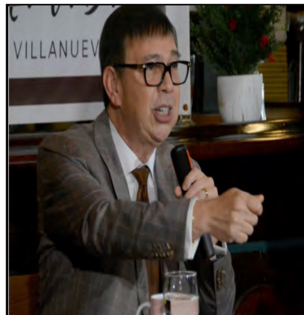
NANINIWALA si Department of Finance Secretary Ralph Recto na nasa 'good track' ang pinansyal na estado ng Pilipinas sa kasalukuyan at sa 2025 matapos siyang humarap sa 'Kapihan sa Manila Bay' kamakailan.