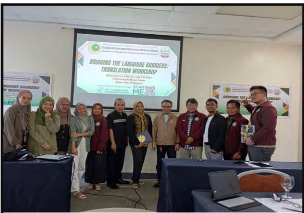
Bridging the Language Barriers: Translation Workshop ng Translation & Interpretation Division (BTA-BARMM), Matagumpay!- story p.3