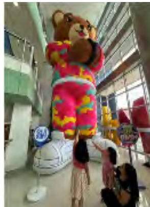
Dash, the 30-foot Dashing Bear of the Giant SM Squad brings cute vibes to SM City Dasmariñas.