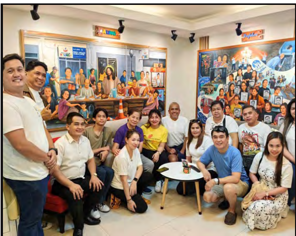
From Heart to Hand, Celebrating with Purpose and a Mission- story p.8