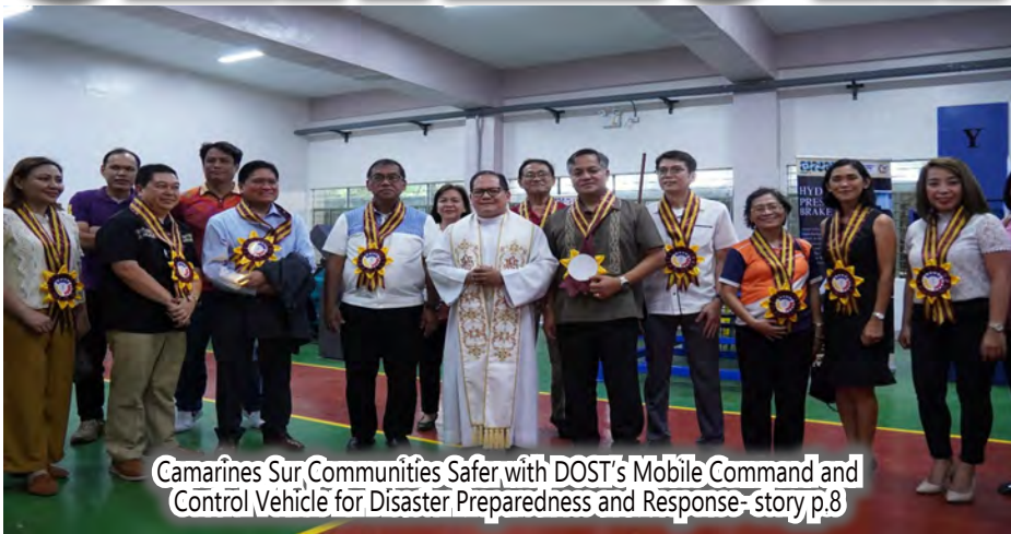
Camarines Sur Communities Safer with DOST's Mobile Command and Control Vehicle for Disaster Preparedness and Response- story p.8