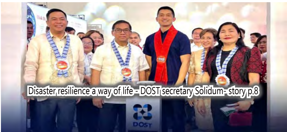
Disaster, resilience a way of life - DOST secretary Solidum- story p.8