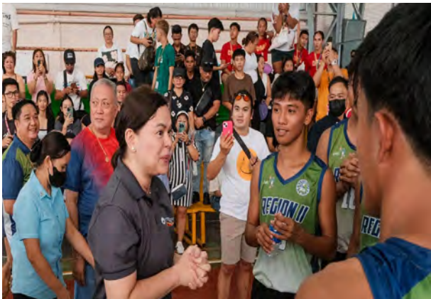
VP DEPED SECRETARY SARA Z DUTERTE @ PALARONG PAMBANSA, CEBU CITY

Kasabay ng pagbubukas ng Palarong Pambansa 2024 sa Cebu City ay ang aking dasal at hangarin para sa tagumpay ng ating mga layunin na maisulong ang akma, napapanahon, at dekalidad na edukasyon para sa mga kabataang Pilipino. Ang Palarong Pambansa 2024 ay nagpapatunay sa paninindigan at dedikasyon ng DepEd para sa ating mga