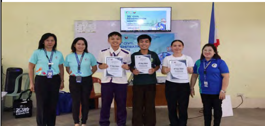
Unleashing Creativity for a Future-Fit CRVS: 35th Civil Registration Month Contests- story p.11