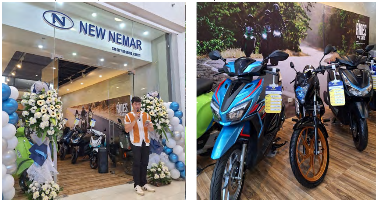
Be among the first to experience premium motorcycles and exceptional service. Visit New Nemar SM City Rosario today and ride home in style!

Exciting news for riders! New Nemar has officially launched its first-ever branch in SM, bringing top-quality motorcycles, unbeatable deals, and exclusive offers—all in one convenient location. Riders can now enjoy the best prices, latest models, and flexible financing options —all in one place! The grand opening was made even more special with the presence of New Nemar's ambassador, JC Santos!