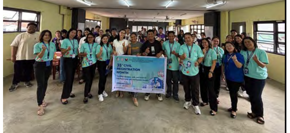
PSA RSO IV-A Conducts Information Dissemination at Royal British College, Inc.- story p.11

ACCEPTING ADS, PLEASE CALL : 0977-7844136/ 0968-7122927