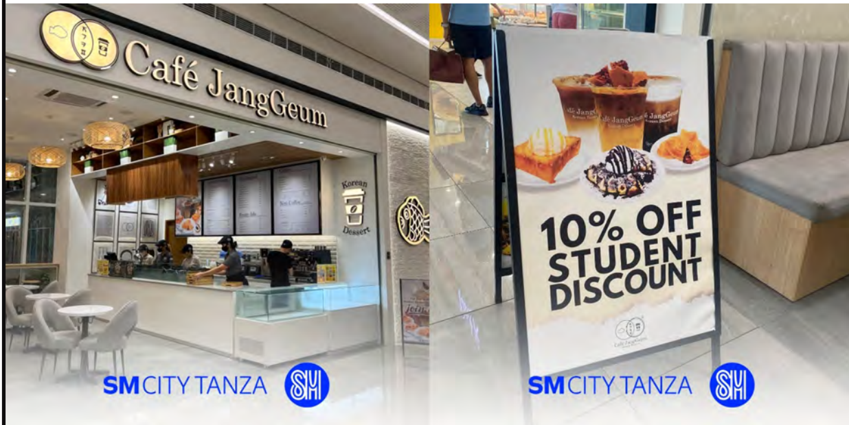
Café Jang Geum at SM City Tanza brings you authentic Korean desserts and snacks! Good news for students—enjoy 10% off when you present a valid student ID! Promo excludes promotional items and frequency card offers.