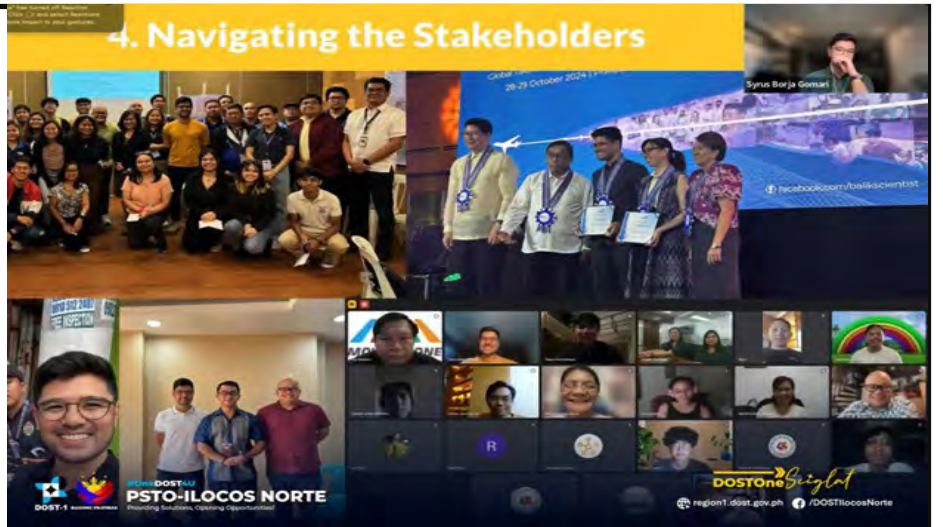
DOST Region 1 Takes the Lead to Modernize Laoag's Transportation with Smart Solutions- story p.5

IMUS, TAGAYTAY, AND NOVELETA RECOGNIZED FOR 1ST CLASS INCOME CLASSIFICATION UPGRADE- story p.11