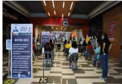
SM City Trece Martires Cinema hallway was repurposed as vaccination drive venue of the Resbakuna Kasangga ng Bida, a local government campaign against COVID-19.

SM is committed to the government to provide assistance to help control the spread of COVID 19.