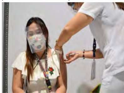
Nurse from the Department of Health prepares the vaccine for the front liner.