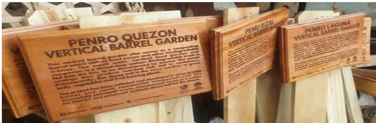
Wooden signages para sa Vertical Barrel Garden