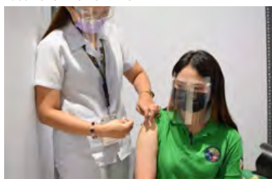
One of the frontliners in the City of Rosario received a vaccine through the government program "Resbakuna, Kasangga ng Bida."