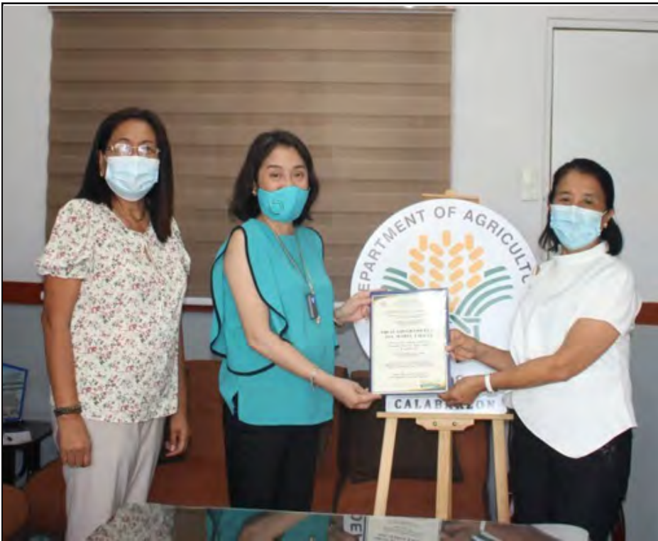
DA-4A grants P5M worth of poultry multiplier breeder farm to LGU Sta. Maria (p.5)