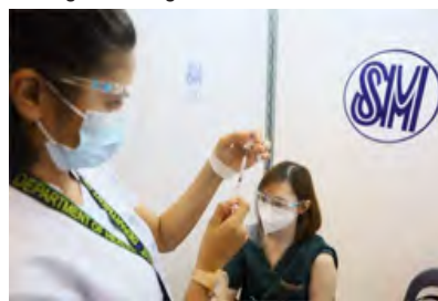
A medical front liner in Trece Martires Cavite was very proud being one of the successful recipients of the vaccine.