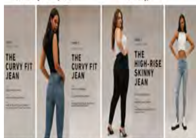
Curvy Fit Jeans flatter a woman's body. High-Rise Skinny Fit Jeans can be worn with everything from a tee to a blazer and heels. The super stretch fabric of Forever 21's Mid-Rise Skinny Fit Jeans will preserve its original shape wear after wear.