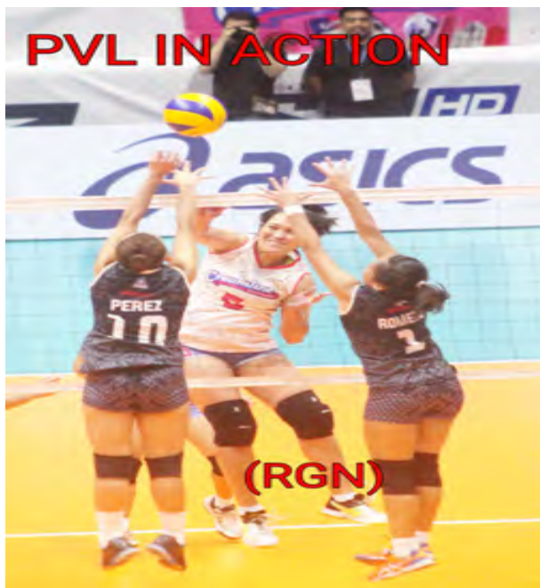
NAATASAN ng maaring mag training bubble ang ilang koponan ng PVL Premier Volleyball League ito ay kaugnay sa pag aproba ng Games and Amusements Board (GAB)