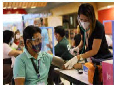
Recipient of Sinovac went through assessment and thorough screening before the vaccine to be shot.