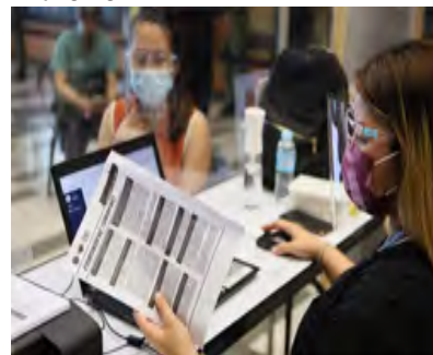
Education about Covid-19 Vaccine-Sinovac was taught to the recipients to make sure full awareness of the vaccines before it will inoculate.