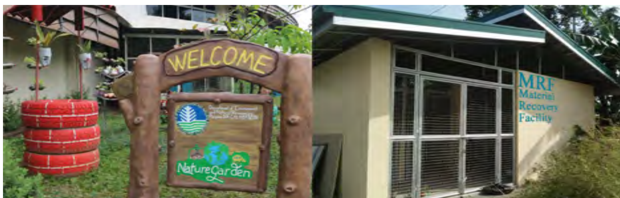
DENR CALABARZON Nature Garden at MRF