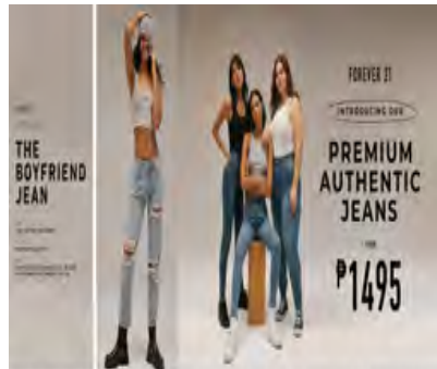
This distressed pair of Boyfriend Fit Jeans sits comfortably on your waist made with rigid denim fabric. Forever 21's Authentic Jeans collection features new styles, better fits, and updated stretch fabric technology.

Come and visit Forever 21 at SM Megamall, SM Makati, SM City Cebu, SM City North EDSA, SM Mall of Asia, SM Aura Premier, SM Lanang Premier, SM City Clark, and Robinson's Magnolia. Precautionary measures are in place to ensure a safe shopping experience for all.