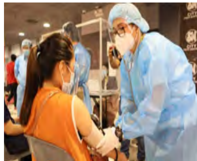
Medical Health worker in PPE monitors the blood pressure of the vaccine recipient.