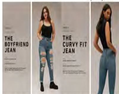
Look effortlessly stylish with Boyfriend Jeans from the Authentic Jeans collection. This pair of ultra-high-rise Curvy Fit Jeans will hug every curve and shape.