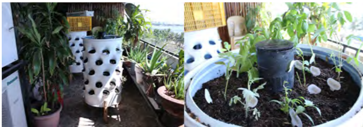
Vertical Barrel Garden sa EMB 4A

tatayo ng eco garden gamit ang mga patapong bagay at nabubulok na basura para sa ikagaganda ng kapaligiran. Maaari rin kayong makipag-ugnayan sa DENR CALABARZON ukol sa pagrequest ng seedlings. Para sa may mga sumbong ukol sa ilegal na gawain na may kaugnayan sa kalikasan ay maaaring tumawag o magbigay ng mensahe sa 8888 hotline numero 09561825774/09198744369. Ang mga retrato, bidyo, at iba pang impormasyon ay maaaring ipadala sa opisyal na Facebook page ng DENR CALABARZON: https://www.facebook.com/DENR4AOfficial/ . PR