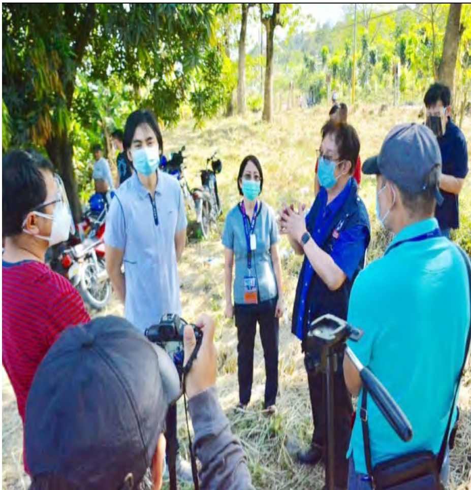
First Rizal DOH regional hospital to rise in Rodriguez (p.5)

SM CENTER IMUS, CAVITE - Enjoy 15% OFF with a minimum spend of P400 when you order online for delivery at Jus & Jerry's SM Center Imus using the Code: STAYHOME15 via J&J Delivery or MrSpeedy and enjoy your time with the family with the perfect food to feast! Jus & Jerry's will always be open to serve you during ECQ or MECQ for takeout, pick-up or delivery via sM Community Riders and partner delivery services. Hurry and grab your favorite meal! This great deal is valid only until April 30,2021.