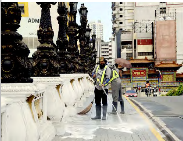
ISINAGAWA ang paglilinis kamakailan sa bangketa ng Jones Bridge, na nag-uugnay sa Intramuros at China Town sa Manila, bilang bahagi ng regular disinfection activities ng pamahalaang lungsod kontra COVID-19.