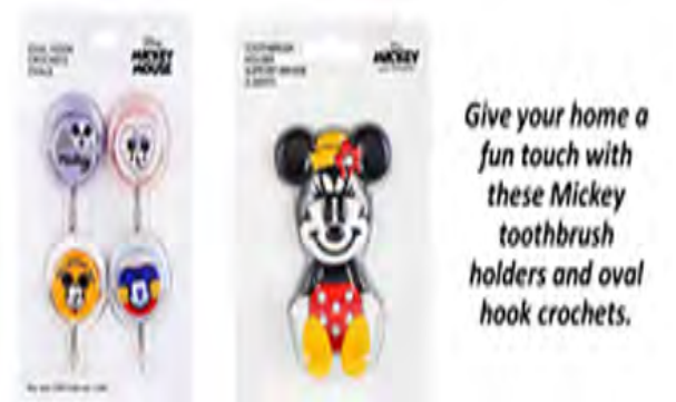
Give your home a fun touch with these Mickey toothbrush holders and oval hook crochets.