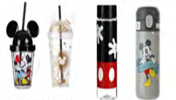
Quench your thirst with Miniso's Mickey Mouse water bottles with straws.

Conveniently shop for your favorite Miniso essentials and Disney inspired items now at the comfort of your homes; just log on to shop.minisoph.com and instantly place your orders! For more details and updates, you can also check out Miniso Philippines at Facebook and Instagram.