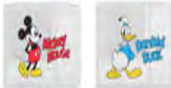
Organizing is more fun with these Mickey Mouse and Donald Duck mini organizers.