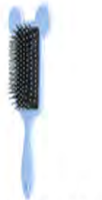
Mickey shaped brush from Miniso.