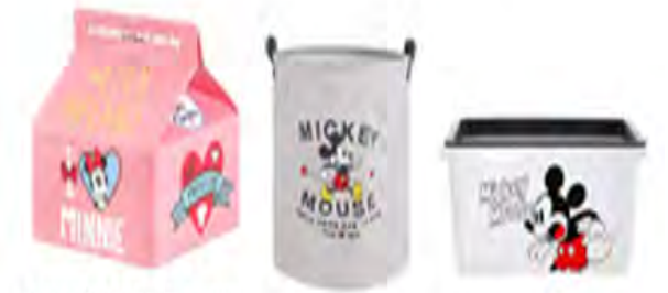
Colorful Minnie milk memo pads available at Miniso.