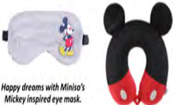
Happy dreams with Miniso's Mickey inspired eye mask.