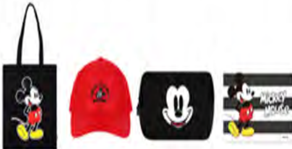
Disney fans will love these fashionable Mickey Mouse cap and string bag. Available at shop.minisoph.com .