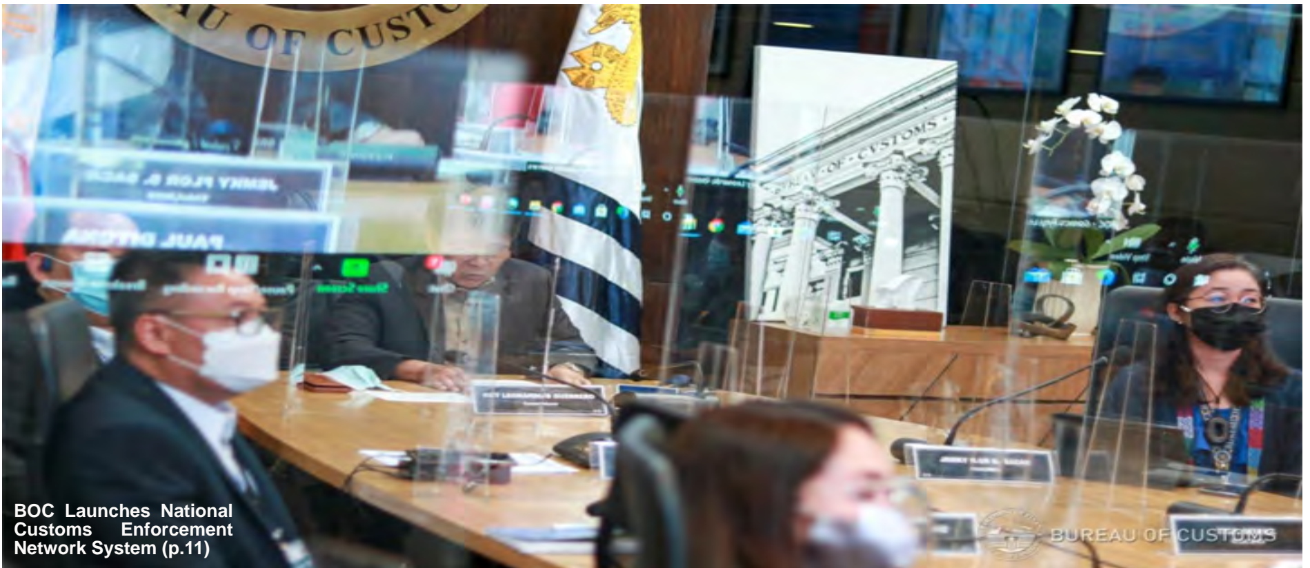
BOC Launches National Customs Enforcement Network System (p.11)