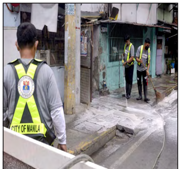
TULOY sa pag-spray ng sabon at chlorine ang mga tauhan ng Manila Department of Public Safety (D.P.S) kamakailan na malaki ang tulong sa pagpigil upang hindi kumalat ang COVID 19 Virus sa kanilang araw-araw na disinfection duty sa kahabaan ng Padre Zamora St. Pandacan Manila.