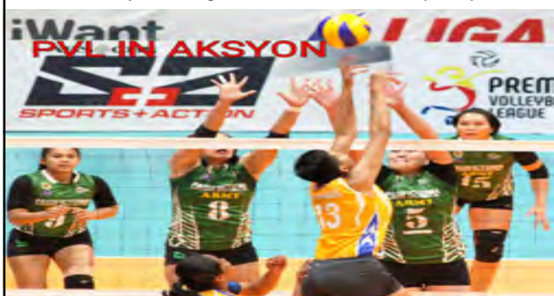
PVL IN AKSYON

MULING matutunghayan ang maaksyong tagpo ito sa pagitan ng Airforce at Army sa pagbubukas ng Premier Volleyball League bubble na gaganapin sa Calamba (RGN)