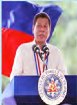
President Rodrigo Roa Duterte