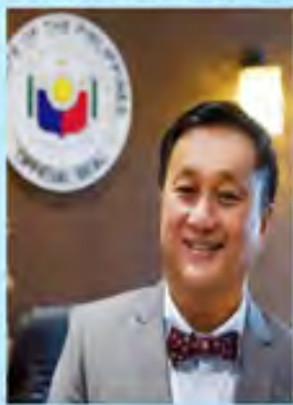
Hon. Francis Tolentino