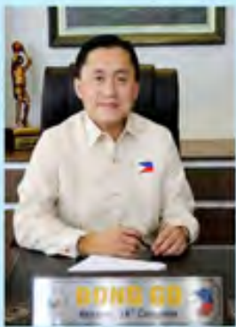
Hon. Christopher "Bong" Go