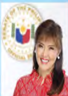
Hon. Imee Marcos