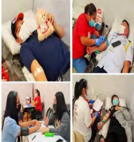
SM CENTER IMUS