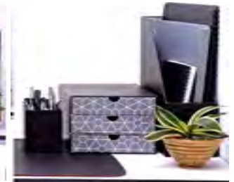
Declutter your desk with this geometric design three-layer desk drawer and matching grey accessories.