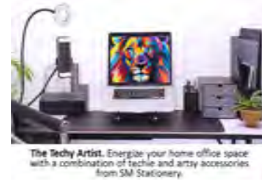
The Techy Artist. Energize your home office space with a combination of techie and artsy accessories from SM Stationery.

Follow SM Stationery PH in Instagram and Facebook and join their Viber community for more details and info.