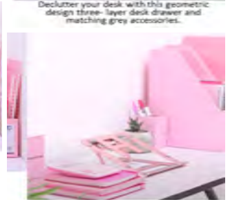
Pretty in pink notebooks and organizers.