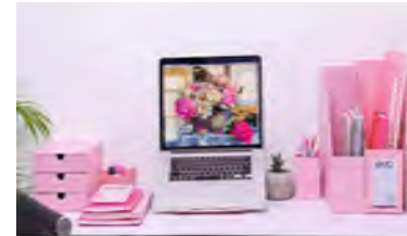
The Girlie Go-Getter. Bring a sophisticated, feminine touch to your work space.