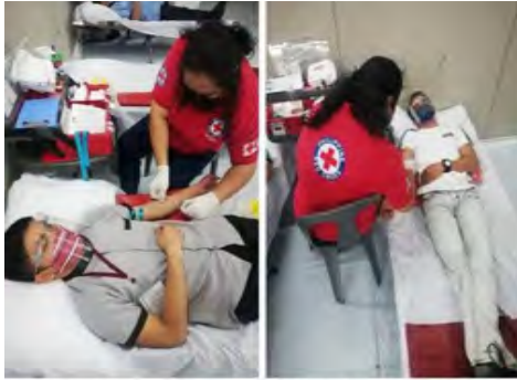
SM CITY ROSARIO

In partnership with The Philippine Blood Center and The Philippine Red Cross, SM Foundation recently held another batch of its 2021 Blood Donation Drive Activity at SM City Trece Martires, SM City Rosario and SM Center Imus. Fifty (50) employees and personnel from SM City Trece Martires and twenty-four (24) employees from SM City Rosario donated blood through the Philippine Red Cross while seventeen (17) employees from SM Center Imus and affiliates donated their blood through the Philippine Blood Center. More SM malls in Cavite will be participating in the coming weeks to help hospitals and the two institutions gather more blood resources to be used during emergency cases especially in this pandemic.