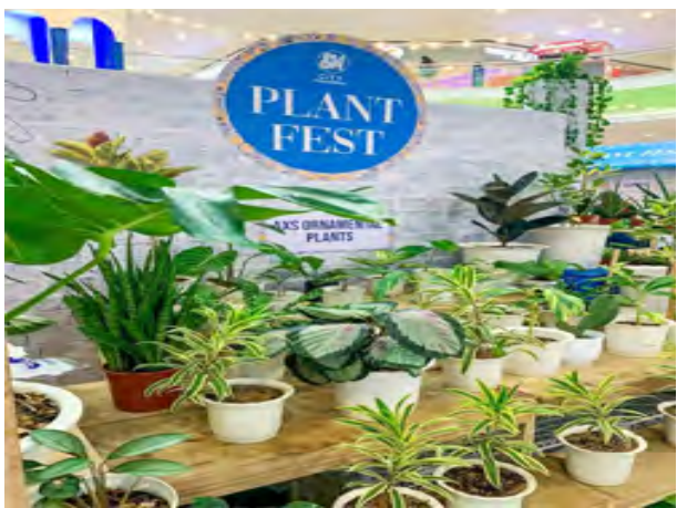
Choose your plants that suit your garden at home from SM City Dasmariñas' Plant Fest