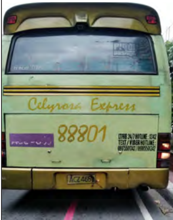
MALUPIT ang bus na ito dahil walang pakundangan sa pagsakop ng linya para sa motorsiklo at bisikleta (motorcycle/bicycle lane). Kuha ito kamakailan ng HANEP lensman sa kahabaan ng Roxas Boulevard.