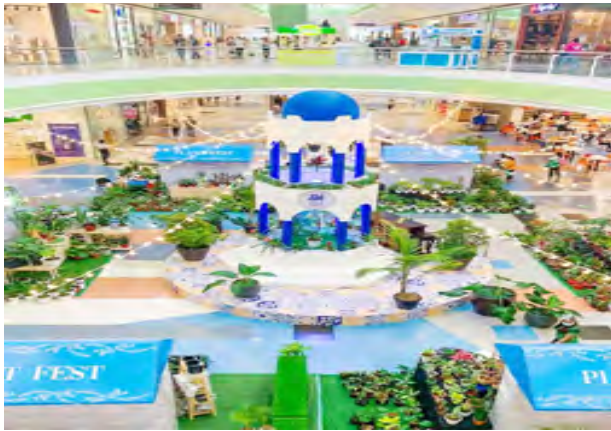
Greek-inspired Gazebo is a special attraction in this year's Plant Festival at SM City Dasmariñas where Plantitos and Plantitas of Cavite meet and expand their plant collection.

Plants make people happy! Join SM City Dasmariñas Plant Festival as they bring a bit of the outdoors into your homes with aweSM deals and tips to expand your green haven. Different experiences you will feel in this Greek-inspired garden with the 15-foot tall gazebo as a special attraction. Local planters and farmers of Cavite such as Lhmn Ph, Clay Defy Ph, AXS, Joyce Mushroom, Fleshy and Spiky Plants and flower shop, King Roberts, Mrs. Pots Pottery, Tres Jardineras and Nyssah's Garden brought all their produce to offer healthy and abundant harvest in the province. Visit SM City Dasmariñas Plant Fest cause it's time to plant and grow that #FreshStartAtSM! But, don't forget to always follow #SafeMallingAtSM guidelines for an enjoyable shopping experience.