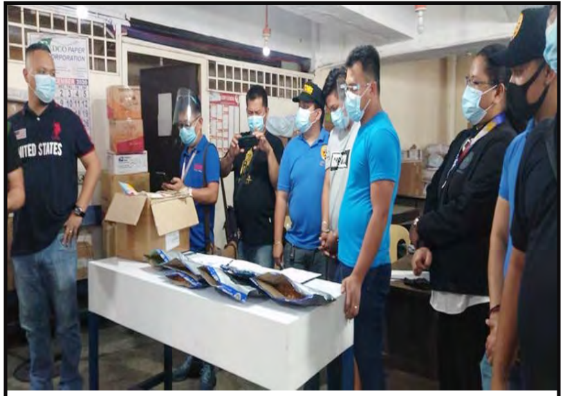
PHLPost photo of authorities presenting the confiscated parcel containing the alleged ecstasy or "party drugs" at the Manila Central Post Office Parcel Division. (story on p.4)

Visit ACE HARDWARE SM City Trece Martires for 3.3 Sale on March 3 and Get 30% off on specials. PLUS get P300 off on purchases of P3,000 & up. T&Cs apply. See you @ ACE Hardware Trece Martires. DTI#114161