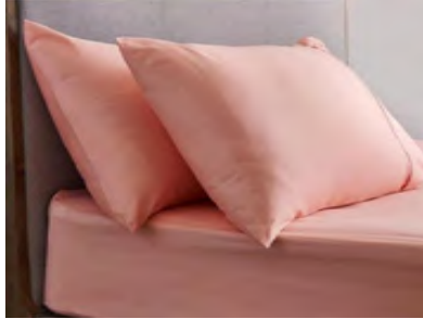
Canadian Organic Cotton sheets with 220-Thread count Fabric and made without the use of pesticides and other harmful chemicals, that are soft and smooth on the skin.