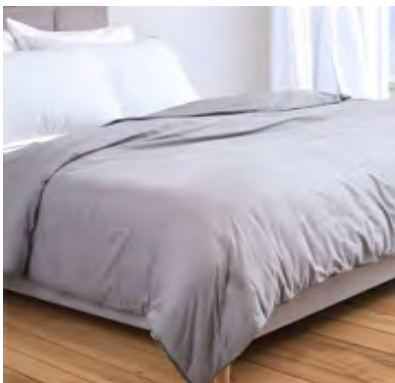
Improve your sleep with a quality weighted blanket that offers massage therapy for both adults and kids alike.