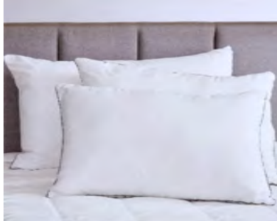
Experience hotel slumber right from your home with Select Hotel Pillows.