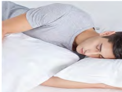
This Mr. Big Bodyscale pillow is filled with Elasta Fiber to fit snugly and promote the healthy firmness of your body.

Shoppers can now also place their orders online through The SM Store's Call to Deliver and ShopSM app. For more info and updates, follow them at SM Home at the SM Store in Instagram or visit thesmstore.com website.