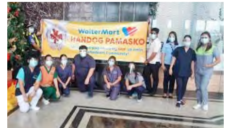
Genti Medical Center and Hospital Inc. received Waltermart's Handog Pamasko gift packs for their frontliners.

SM CITY BACOOR, CAVITE - Nothing beats ending your day or the week with a good meal as you dine with good music and fresh air at Al Fresco Dining at SM City Bacoor! Eat, sip, and chill with your favorite humans and enjoy the best tasting cuisine SM City Bacoor's casual dining has to offer. Choose from the mouth-watering dishes of Botejiyu, Classic Savory, Lechon Haus, Gerry's Grill, Max's Restaurant, Manam Comfort Filipino, and Hap Chan. Fur Parent? You can bring your adorable pets too because malling is more fun with them! So save the date with your family, friends, and FURiends and choose the best spot from 4:00-9:00PM at Al Fresco Dining at the Main Mall Entrance of SM City Bacoor. Enjoy!