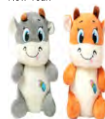
The ox girl is sweet in disposition just like these pastel colored stuffed toys.