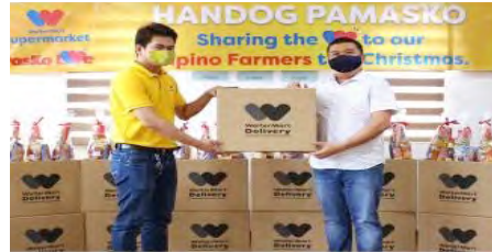
Waltermart donations of Handog Pamasko gift packs to San Jose Farmers.