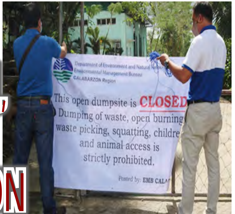
Pagpapasara ng open dumpsite sa Sto. Tomas, Batangas noong 25 Enero.

ACCEPTING ADS, PLEASE CALL : 0977-7844136/ 0929-8127638