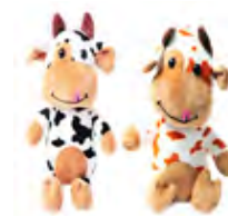
Welcome the Chinese New Year with lots of luck and fun with these speckled oxen inspired plushies from Toy Kingdom.

For more updates, follow @ToyKingdomPH at Facebook and Instagram.