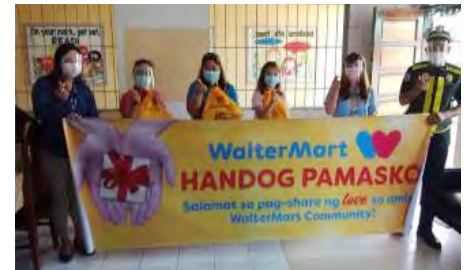
Paridel Central School teachers were delighted to receive Waltermart's Handog Pamasko gift packs.