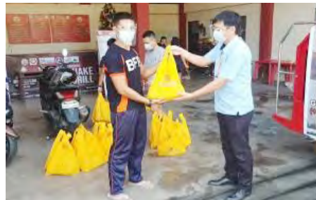
Waltermart donated Handog Pamasko gift packs to Bureau of Fire Protection (BFP) of Guiguinto, Bulacan.