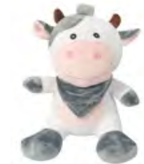
Let this cute ox plush toy from Toy Kingdom be your friend this Chinese New Year.