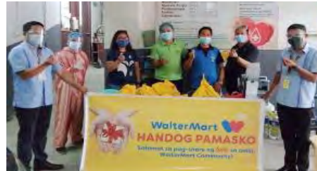
Waltermart provides Handog Pamasko gift packs to medical frontliners of Bulacan Medical Mission Group Hospital (BMMG Hospital)