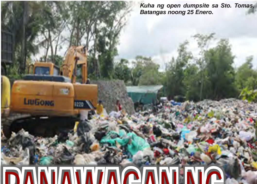
Kuha ng open dumpsite sa Sto. Tomas, Batangas noong 25 Enero.