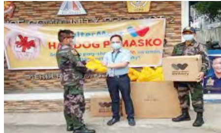
Waltermart turns over its Handog Pamasko gift pack donations to the Philippine National Police (PNP) in Baler Station

Check out the Handog Pamasko Thank you video link: http://bit.ly/2XaxjEz . For more updates, visit our facebook page @WaltermartMalOficial, @WaltermartSupermarket or check our website at www.waltermart.com.ph