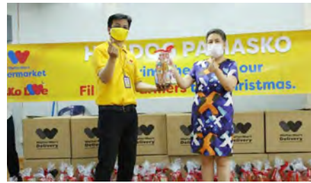
The Ateneo Center for Education (Tanging Yaman for Farmers) received Waltermart donations of Handog Pamasko gift packs.