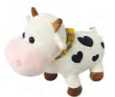
Feel the luck and love with this ox plush toy with heart shaped dots.