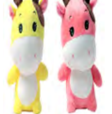
Let these ox plush toys from Toy Kingdom be your buddies this New Year.