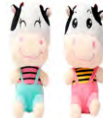
Ox boys like to play sports just like these cuddly toys in overalls from Toy Kingdom.