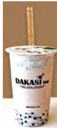
Dakasi's Creamy Oreo Milk Tea