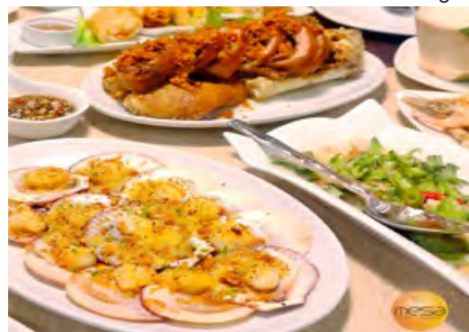
Filipino comfort food favorites from Mesa