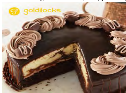
Sweet Double Dutch Cake from Goldilocks