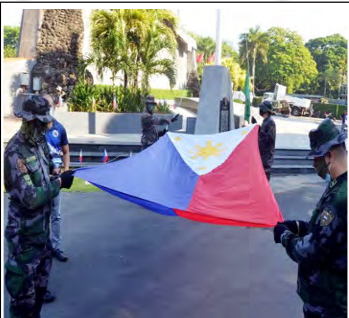
GINUNITA ang National Flag Day kamakailan sa Maynila na pinangunahan ni Mayor Fransisco Isko Moreno Domagoso. (Christian Heramis)

ACCEPTING ADS, PLEASE CALL : 0977-7844136/ 0929-8127638