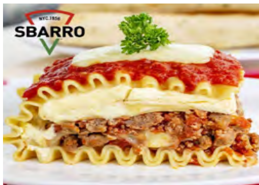
Meaty Lasagna from Sbarro