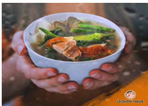
Lechon Haus' Lechon Sinigang

Enjoy the specialty restaurant experience at home with SM City Dasmariñas To-Go service.