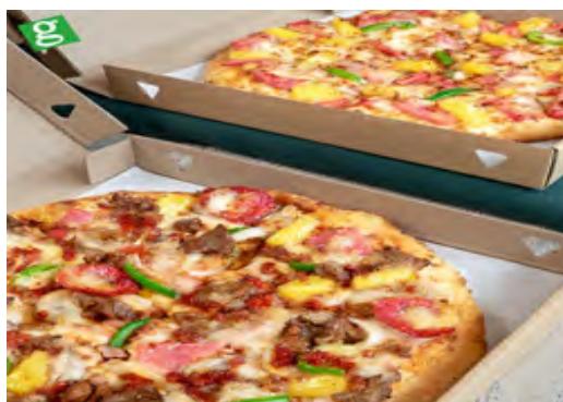
Pizza favorites from Greenwich