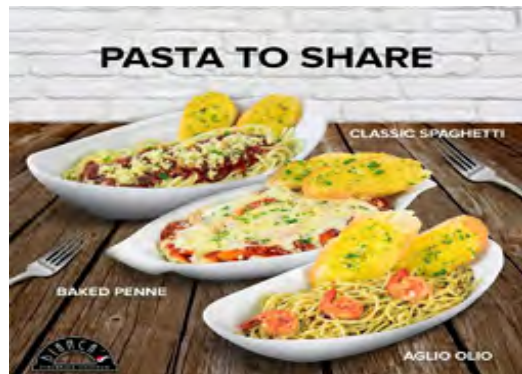
Aside from firebrick-cooked-chicken, Bianca's Firebrick Chicken also offer Pasta for sharing.