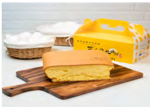
Jim's Recipe's Buttery-fluffy sponge cake