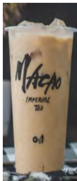
Macao Imperial Tea's Milk Tea