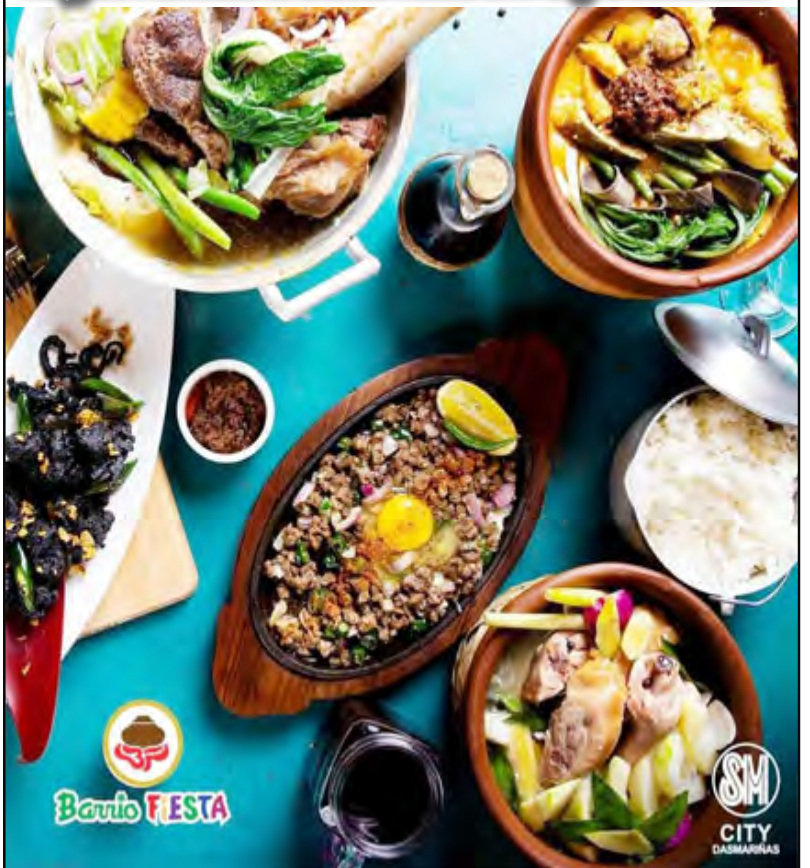
Filipino favorite and comfort food at its best at Barrio Fiesta SM City Dasmariñas. Visit Barrio Fiesta at the Lower Ground Level. #DelightInTaste #EverythingHere-AtSM

ACCEPTING ADS, PLEASE CALL : 0977-7844136/ 0929-8127638