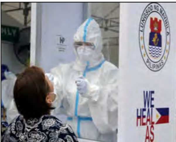
BAHAGI ito ng pagsasagawa ng RT-PCR test ng lokal na pamahalaan ng Maynila. Nasa 100 katao ang maaaring maserbisuhan nito mula sa mga residente ng Maynila at maging sa karatig lungsod. Kuha ito kamakailan sa Quirino Grand Stand.

According to PNP, a total of 25,537 police officers composed of 2,151 PCOs and 23,386 PCOs from its 17 regional offices have