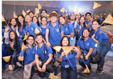
SMFI 1 – SM Scholars' General Assembly last 2019.

among others. To apply, visit https://scholarship.sm-foundation.org . For more updates, follow SM Foundation's official social media accounts (Facebook, Twitter, Instagram, and YouTube): @SM-FoundationInc. SM Foundation, through its Scholarship program, provides deserving and qualified students with access to college education and technical-vocational studies since 1993. To date, SMFI has supported almost 5,500 scholar-graduates nationwide.