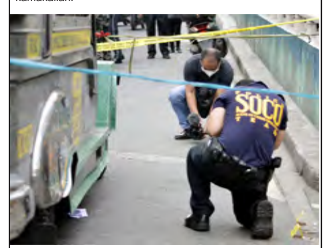
ANG mga operatiba ng SOCO habang nagsasagawa ng pagsisiyasat sa nangyaring pamamaril at pagpatay sa dalawang lalaking kakalaya pa lamang sa kulungan habang lulan ng pampasaherong dyip sa Sta. Cruz, Maynila kamakailan.