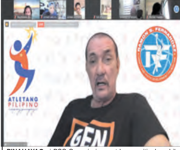
PINAHAYAG ni PSC Commissioner at bagong itinalaga bilang Chef de Mission ng Sea Games Ramon Fernandez sa linguhang TOPS Usapang sports via Zoom online week 2 na magiging priority nito ang kalusugan ng mga atleta habang wala sa bansa ang vaccine kontra covid 19. ( RGN )

Sa pagdating ng mga umaasa sa Tokyo Olimpiko sa susunod na katapusan ng linggo, nangangahulugan ito na ang mga pambansang atleta mula sa apat na disiplina ay magiging inspire bago ang isang abalang 2021 sa palakasan.