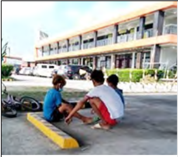
SUGAL PA MORE: Naaktuhan ng HANEP lensman ang tatlong lalaking menor de edad habang nagsusugal ng larong cara y cruz sa compound ng isang supermarket sa Cavite kamakailan.