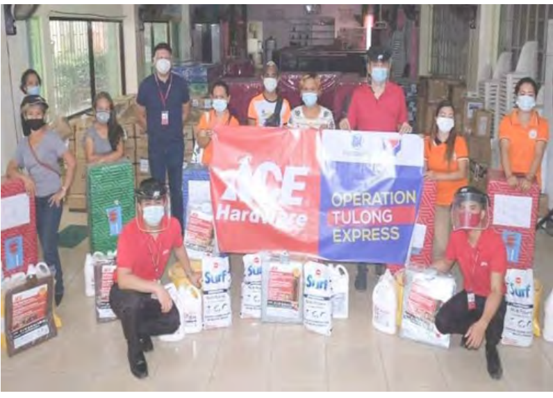
The Kasiglahan Village residents received donations of beds, mats, cleaning materials and PPEs from ACE Hardware that will help them rebuild their homes and keep their families safe from Covid-19 pandemic.