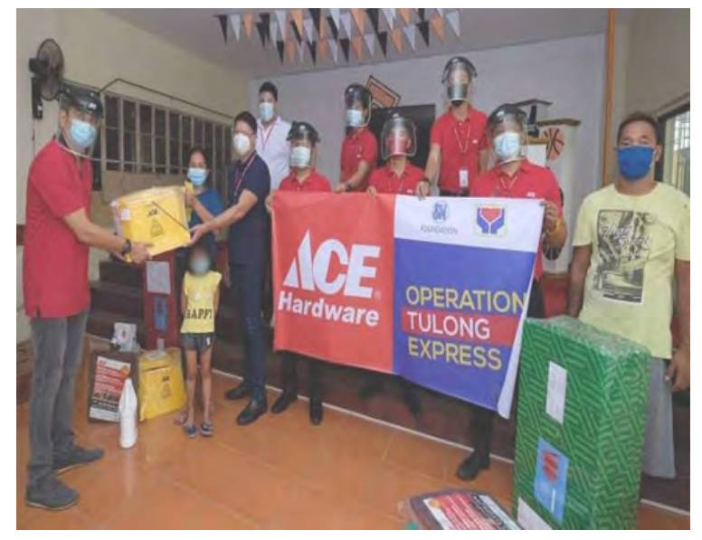
The ACE Hardware team turns over the donations to the residents of Kasiglahan Village Rodriguez Rizal with SM Foundation and DSWD.

While the series typhoons late last year have gone, many of those severely affected are still trying to rebuild their lives. To help fast-track recovery, ACE Hardware staff recently donated needed items such as bed & mats, PPEs, and cleaning materials to affected residents of Kasiglahan Village Rodriguez, Rizal. This activity was held jointly with SM Foundation and the local DSWD chapter. To fulfill its "Helpful Place" promise, ACE Hardware communities serves through outreach initiatives like this, as well as provide customers nationwide with relevant and helpful products.