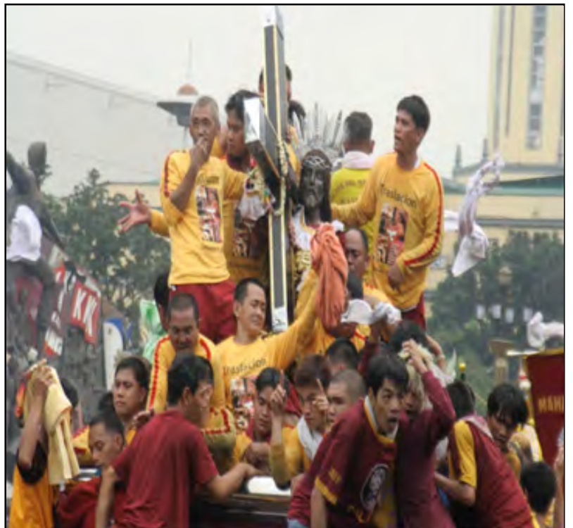
DAHIL sa pandemiya dulot ng COVID-19 ay walang traslacion para sa kapistahan ng Itim na Nazareno ngayong taon gayunman ay nananatiling buo at matibay ang paniniwala at pananalig ng milyong deboto sa Mahal na Poon.