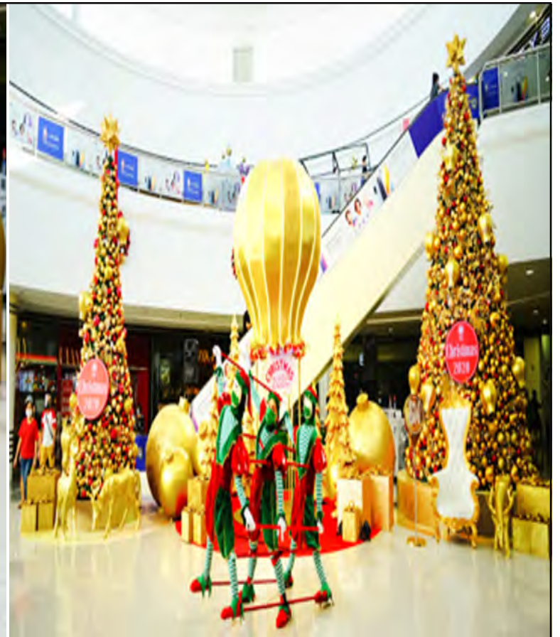
LOOK: Santa's Elves came a little early to make smiles and excitement contagious as they dance merrily at SM City Molino's Christmas Centerpiece. Check out SM City Molino's Facebook Page and see how these elves grooved to the sounds of Christmas.