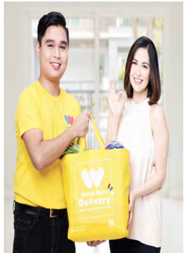
And she is happy that WalterMart supermarket has many available options of good quality products that can fit into one's budget. "Kumpleto dito eh," she says