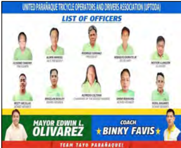
New elected officers from group (UPTODA) from Barangay San Isidro, Paranaque City.