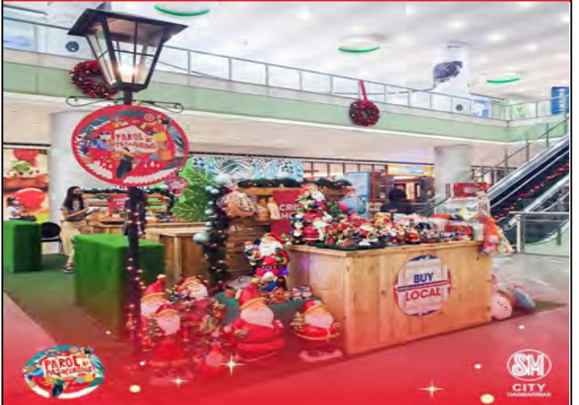
Feel the season of Christmas as SM City Dasmariñas brings you Christmas Market with different locally-made gift ideas and home decors for this holidays. Visit Parol and Pasalubong Christmas Market located at Upper Ground Level Annex, near Pepper Lunch.