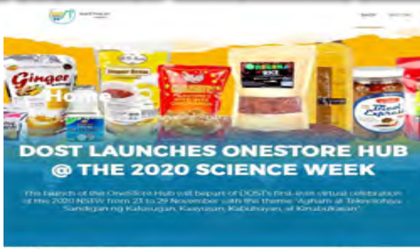
DEPARTMENT OF SCIENCE AND TECHNOLOGY | @dostph

Soon, he said a bigger project called Smart Food Value Chain stores will also be launched. It will involve and generate a wide range of economic and related activities because the bigger percentage sold in store hubs are food products. "This covers activities like planting to produce the raw materials; post-harvest processing, storage, logistics in taking the products to markets where they are in demand like food innovation centers where products are being processed