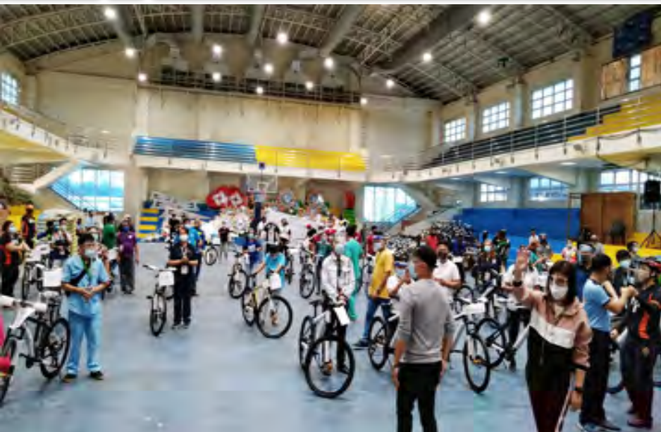
ABALA ang mag-inang Revilla kasama ang iba pang opisyal sa ginawang pamamahagi ng mga bisikleta kaugnay ng programang BIKE WITH A HEART: Lingap Bisikleta para sa mga Manggagawang Bacooreno. RS

ACCEPTING ADS, PLEASE CALL : 0977-7844136/ 0929-8127638