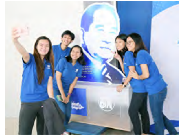
SM Scholars' General Assembly last 2019.

SM Foundation, through its Scholarship program, provides deserving and qualified students with access to college education and technical-vocational studies since 1993. To date, SMFI has supported almost 5,500 scholars nationwide.