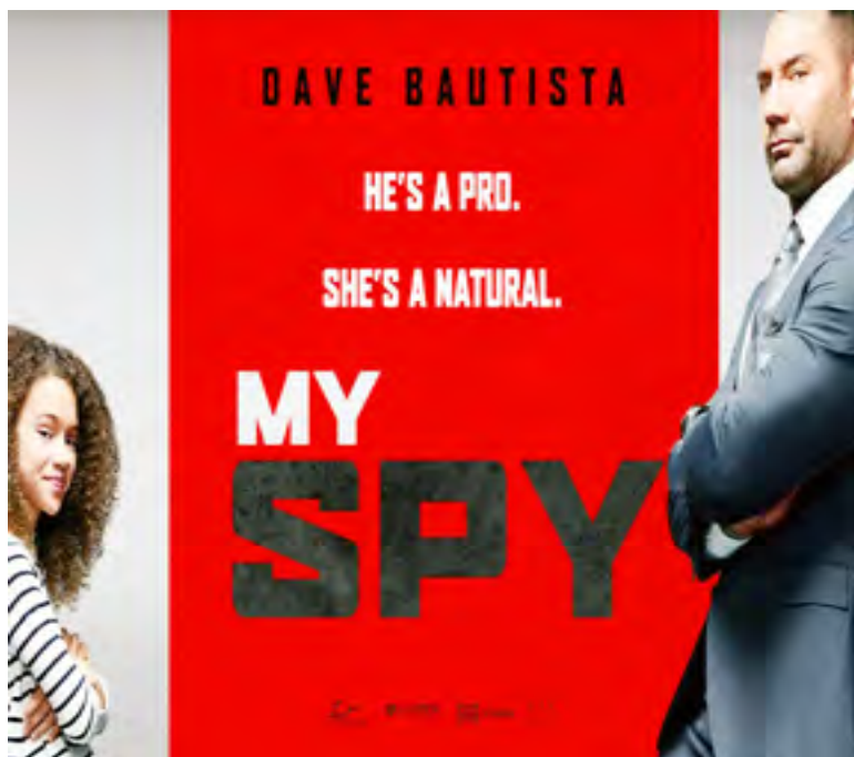
This CIA agent has a new BFF. My Spy is coming to SM Cinema at SM City Dasmariñas, SM City Bacoor, SM City Trece Martires and SM City Molino.