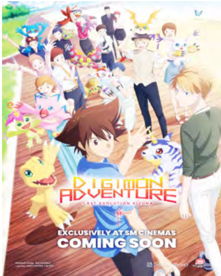
Digimon Adventure: Last Evolution Kizuna , is a Japanese animated action adventure film produced by Toei Animation and animated by Yumeta Company. Set in the same continuity of the first two Digimon television anime series, the film serves as the series finale of the original Digimon Adventure story. This SM exclusive is coming soon at SM Cinema at SM City Dasmariñas, SM City Bacoor, SM City Trece Martires and SM City Molino.

Facebook and @SM_Cinema on Instagram. Book your tickets at www.smcinema.com or download the SM Cinema app.