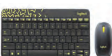
Go wireless with this Nano Wireless keyboard and mouse combo.