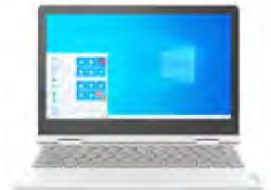
Master online classes with the Lenovo Ideapad3 series.

SM Stationery and Gadgets Hub is now online on www.smstationery.com.ph and with the SM Store's #143SM Call to Deliver services. You can now have your homeschool must-haves delivered right to your doorstep. Follow SM Stationery PH in Instagram and Facebook and join their Viber community for more details and info.