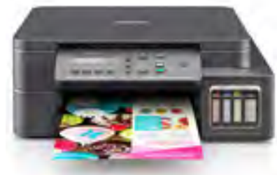
Use this Brother inkjet multi-function printer for all your printing needs.