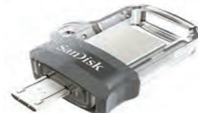
Save files in mobile or with your PC with Sandisk OTG Ultra Dual USB Drive .