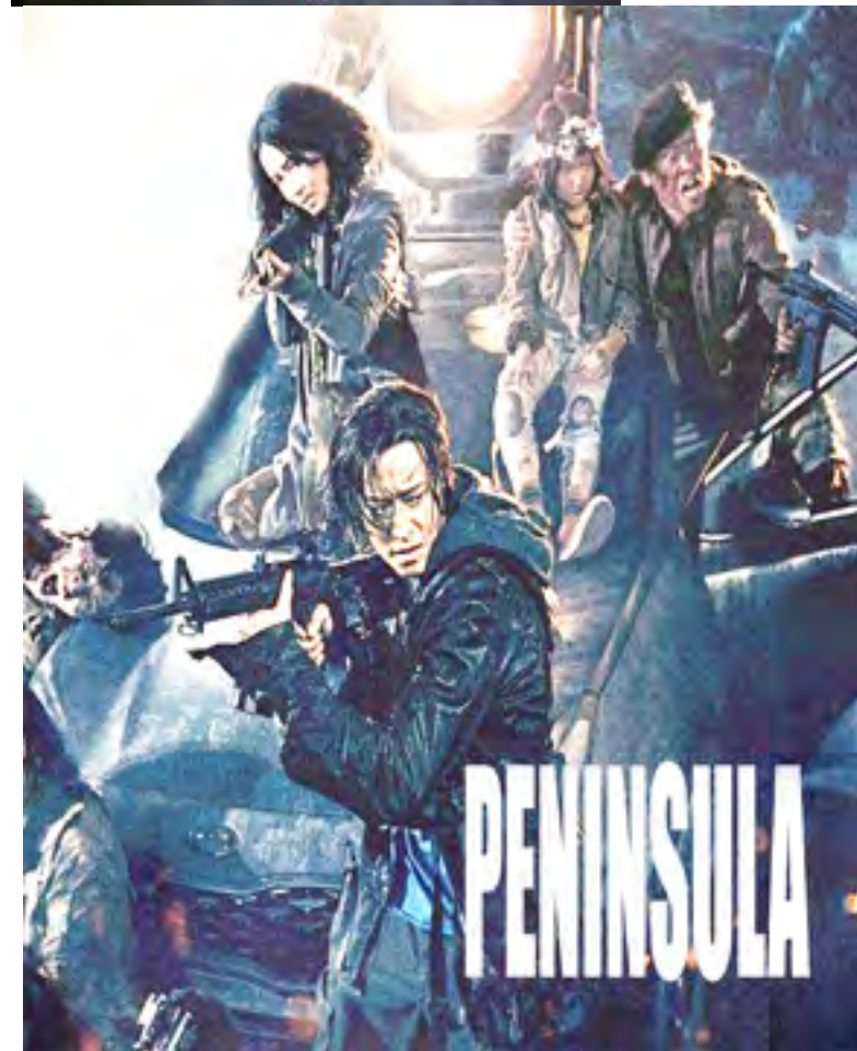
PENINSULA is the next nail-biting chapter in acclaimed director Yeon Sang-ho's post-apocalyptic world. This comes four years after South Korea's total decimation in TRAIN TO BUSAN , the zombie thriller that captivated audiences worldwide. Coming soon at SM Cinema at SM City Dasmariñas, SM City Bacoor, SM City Trece Martires and SM City Molino.

As the movie travels with BTS, it also explores each band member behind the curtain. Off stage, we see another side of BTS. The seven members begin to candidly tell personal stories they have never voiced before. Coming soon at SM Cinema at SM City Dasmariñas, SM City Bacoor, SM City Trece Martires and SM City Molino.