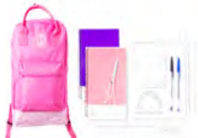
Keep your kids busy and stay smart with the right homeschool supplies in this All-in-One School backpack .