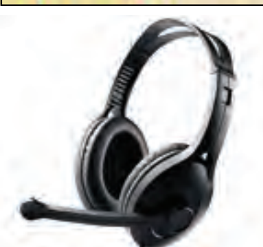
Easy to Plug and Play Edifier K800 Headset with adjustable head bands and foam ear cups for comfort fit