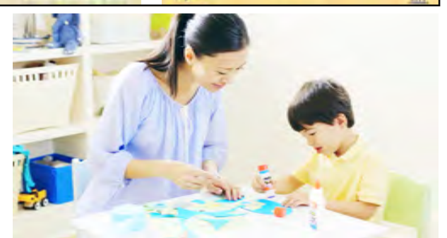
Homeschooling sparks creative learning and fun parenting that must go hand in hand.